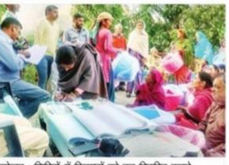
सोलन : शिविरों में किसानों को टब वितरित करते अधिकारी।

शिमला - नाबार्ड के बुधवार को आयोजित राज्य ऋण सेमिनार के दौरान, जहां नाबार्ड द्वारा पोषित विभिन्न स्वयं सहायता समुहों, फार्मर क्लबों तथा जेएलजी को सम्मानित किया गया। वहीं किसान उत्पादक संगठनों (एफपीओ) को प्रोत्साहित करने वाले प्रोड्यूसर आर्गेनाइजेशन प्रोमोटिंग इंस्टीट्यूशंस (पीओ पीआई) को भी सम्मानित किया गया। इसी क्रम में हिल एग्रीकल्चर एंड रूरल डिवलपमेंट प्रोमोशन सोसाइटी (हार्प) शिमला को छह एफपीओ को बढावा देने और उनका पोषण करने के लिए सम्मानित किया गया। हार्प संस्था द्वारा प्रोमोटेड एक किसान उत्पादक संगठन-मलूठी फल, फूल व सब्जी उत्पादक व विपणन को-आपरेटिव सोसायटी लिमिटेड, गांव मलूठी, जिला शिमला को भी उसके उत्कृष्ट कार्यों के लिए सम्मानित किया।