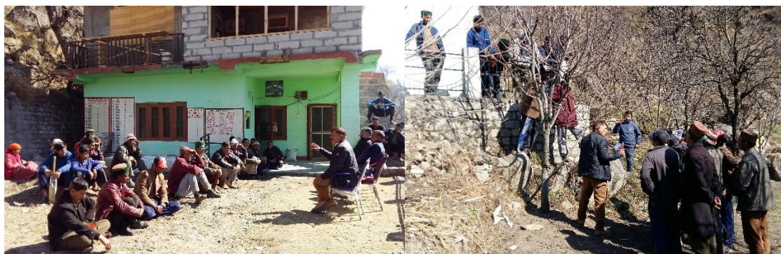
Figure 5. Demonstration of training and pruning process of apple plants held on 14 February 2020 for the farmers of Chhota Kamba and Gharshu villages at Chhota Kamba, Nichar Block, District Kinnaur.