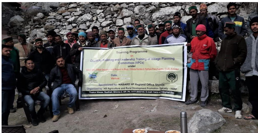
Figure 4. Capacity building and leadership training to the leaders of Village Planning Committees (VPCs) of village Nathpa and Kachrang of Nichar Block, District Kinnaur held on 13 February 2020.