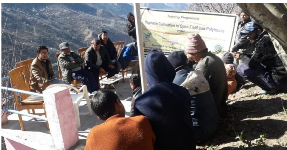
Figure 3. Training on vegetable cultivation in open field and poly house held on 23 December 2019 for the farmers of village Kandara, Nichar Block, District Kinnaur.