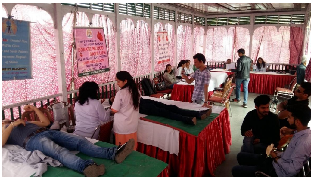
Figure 11. Blood donation camp organised on 14 April 2019 at the Ridge, Shimla.