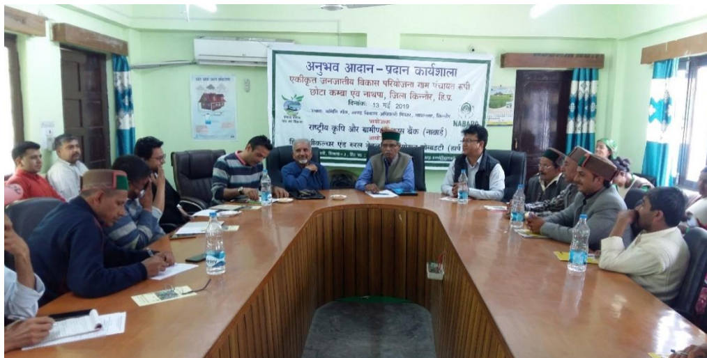
Figure 1. Experience sharing workshop organised on 13 th May 2019 under TDF Project at Samiti Hall of Block Development Office at Bhaba Nagar, Kinnaur.