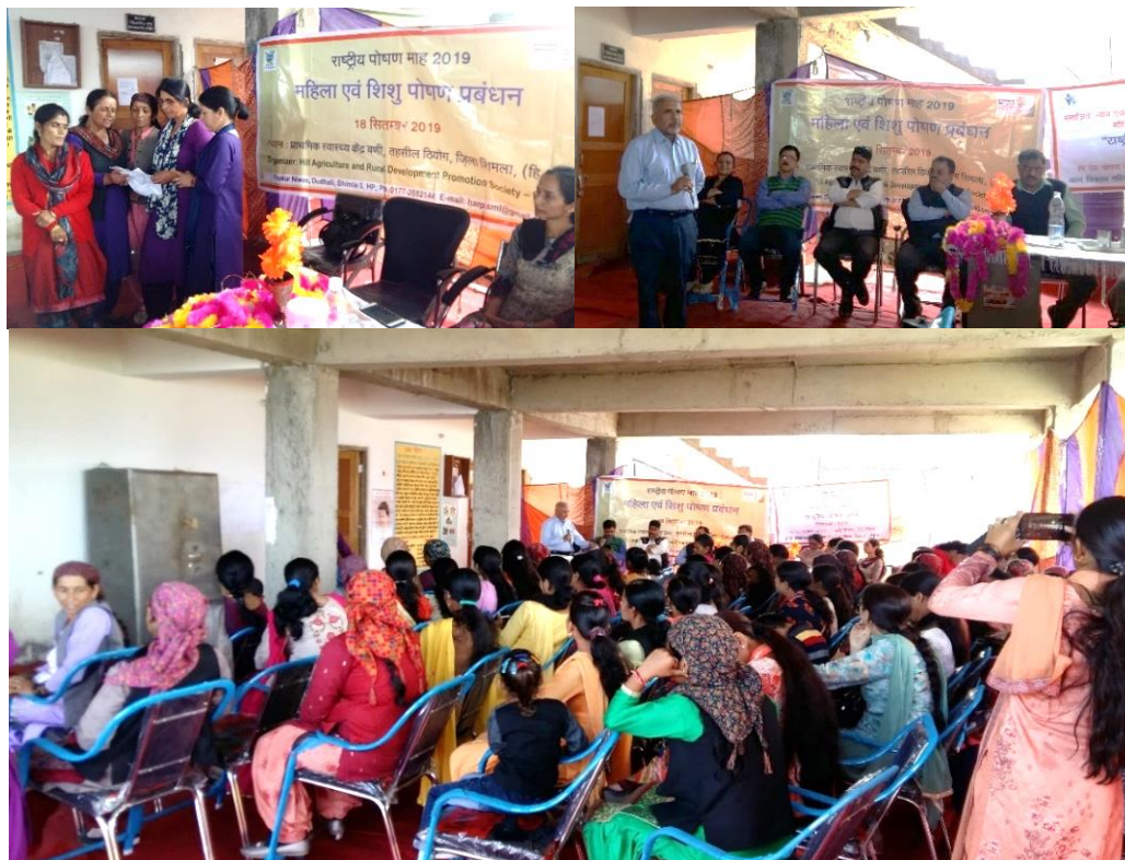
Figure 12. Awareness camp on Women and Child Nutrition Management organised on 18 September 2019 in collaboration with the Mahila Mandal Bani (Fagu) at Gram Panchayat Bani, district Shimla.