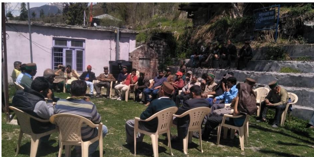
Figure 7. Awareness-cum-sensitization of the farm producers of gram panchayat Bari, district Kinnaur and formation of a Farmer Producer Organisation (FPO) on April 11, 2020.

Farm producers' awareness campaign - An awareness-cum-sensitization programme for the farm producers of gram panchayat Bari, district Kinnaur was organized at Bari on 11 th April 2019. Total 38 farmers of Bari panchayat have participated in this programme. The farmers were made aware about the importance of organizations. The participating farm producers decided to get organised into a FPO and elected a provisional management committee which was registered as 'Bari Fruit and Vegetable Growers cum Marketing Cooperative Society Ltd.' This FPO will support all farmers in input supply management and market of their produce.