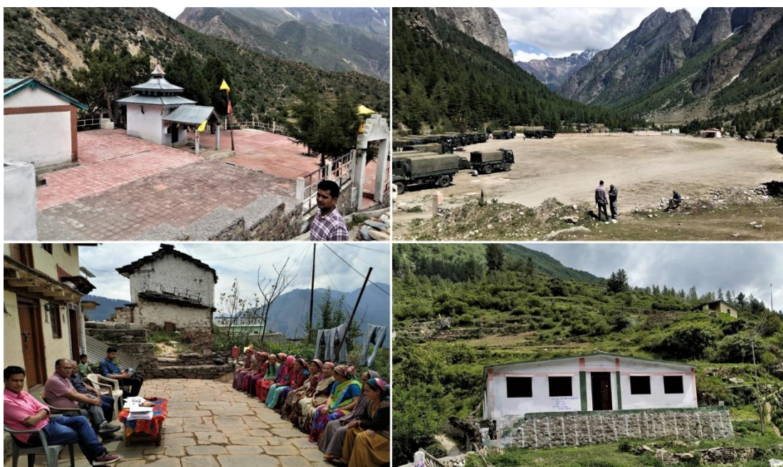
Figure 10. Glimpses of field verification of Projects/Schemes under – Third Party Monitoring of Border Area Development Programme (BADP) in the boarder block of Chamoli district, Uttarakhand.