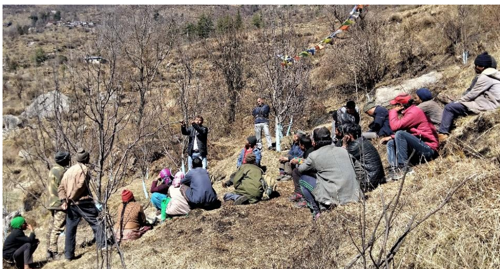
Figure 6. Demonstration of training and pruning process of apple plants held on 15 February 2020 for the farmers of Majhgaon and Shigarcha villages at Majhgaon, Nichar Block, District Kinnaur.