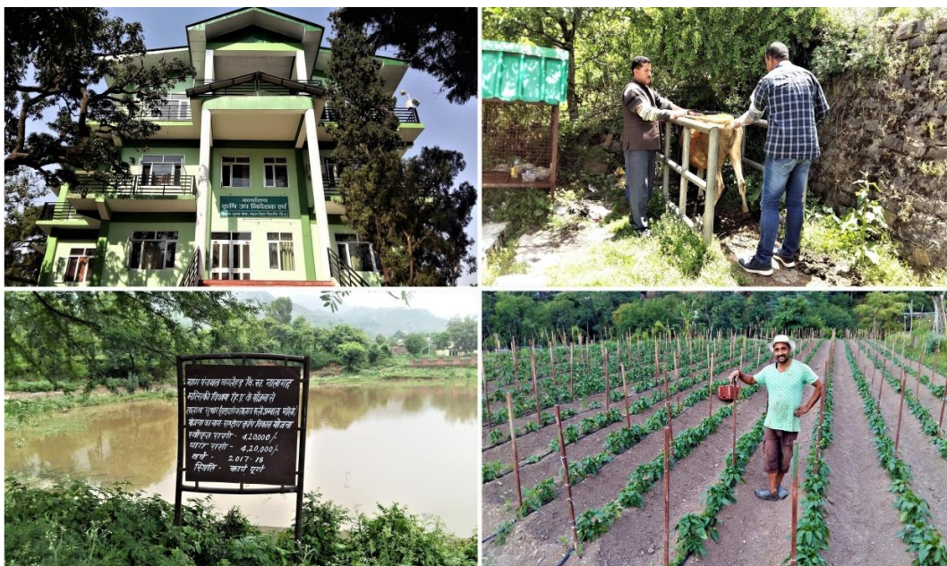
Figure 8. Glimpses of field verification of a study – Third Party Evaluation of Rashtriya Krishi Vikas Yojana (RKVY) Projects implemented during 2017-18 in Himachal Pradesh.

Field data was collected on designed questionnaire, was compiled, analyzed and a report was submitted to NABCONS/Agriculture Department, Himachal Pradesh.