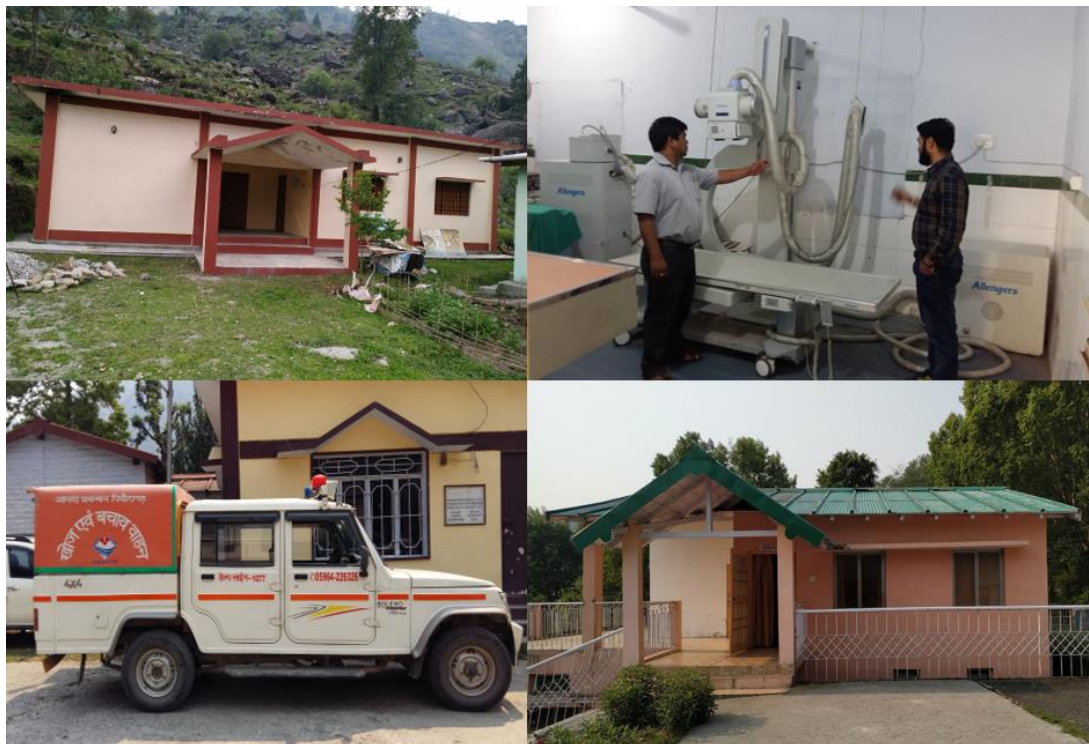
Figure 9. Glimpses of field verification of Projects/Schemes under – Third Party Monitoring of Border Area Development Programme (BADP) in the border blocks of Pithoragarh district, Uttarakhand.