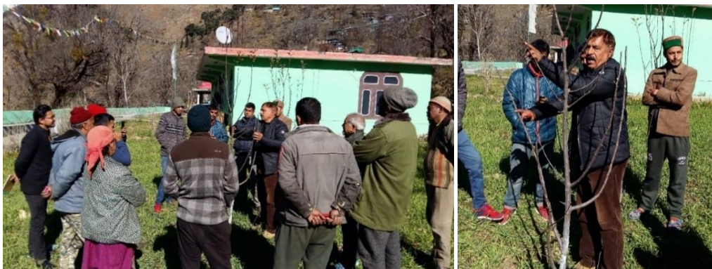
Figure 2. Demonstration of training and pruning process of apple plants at village Bara Kamba, Nichar Block, District Kinnaur on 22 December 2019.