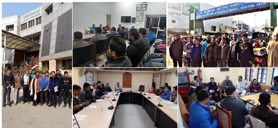
Fig 7. Exposure visit of the members of five FPOs to the APMCs and fruit, vegetable and flowers markets of Chandigarh, Azadpur (Delhi) and Gazipur (UP), organised between 7 th to 10 th January 2019.