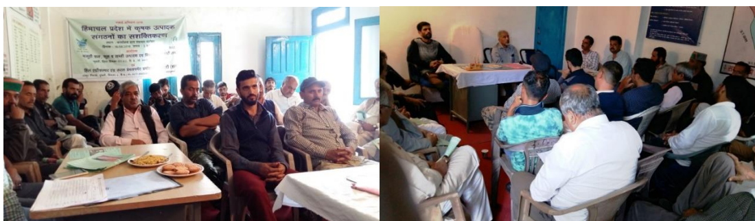
Fig 10. NABARD campaign – Strengthening of FPO Maloothi was organised on 16 th & 20 th August, 2018 at Chamyana and Patgehar gram panchayats, district Shimla.