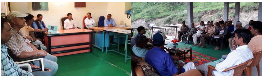
Fig 12. NABARD campaign – Strengthening of FPO Subzi Utpadak – Bhanoti was organised on 11 th , 12 th & 15 th August 2018 at Bagshad and Bhanoti gram panchayats, district Mandi.