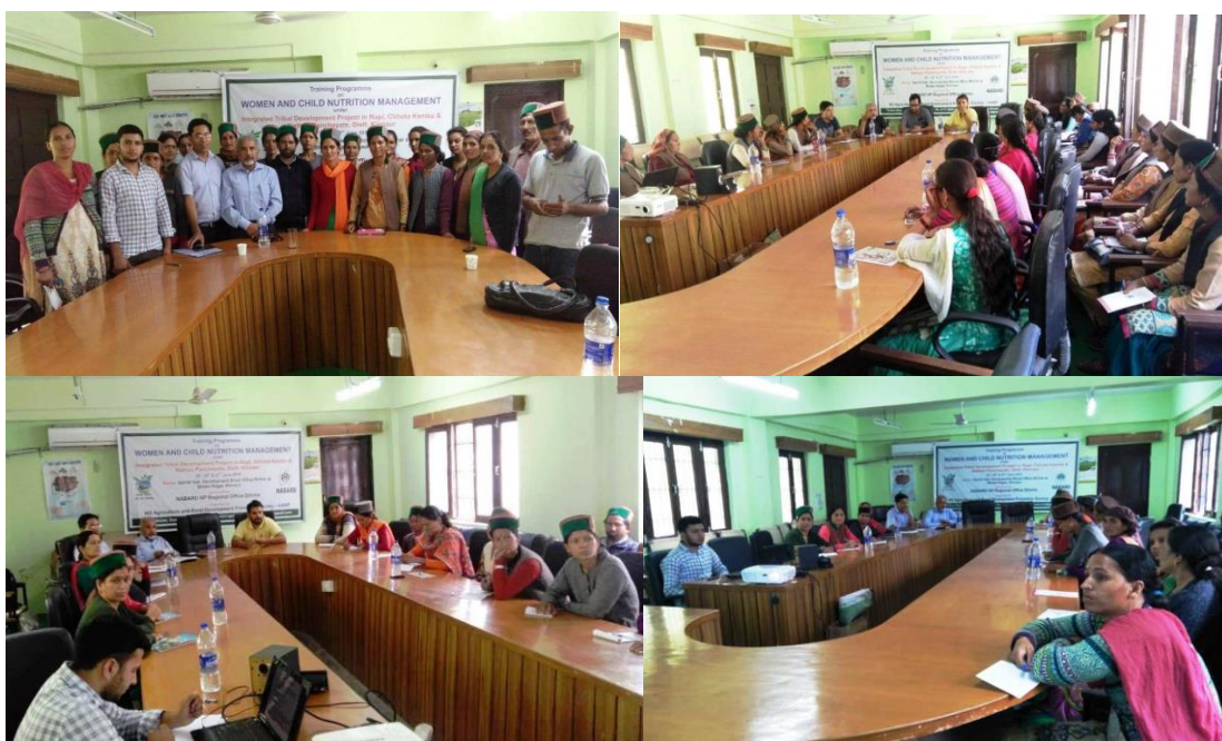
Fig 3. Workshops on women & child nutrition management organised on 25 th , 26 th & 27 th June 2018 for farmers and farm women of Chhota Kamba, Rupī and Nathpa gram panchayats at Bhabanagar, Kinnaur.

In these workshops 28, 21 and 31 farm women have participated from Chhota Kamba, Rupī and Nathpa respectively. The farm women were made aware about the nutritional requirements of pregnant women, women after child birth, children and old women. They were also shown documentary films on the related topics.