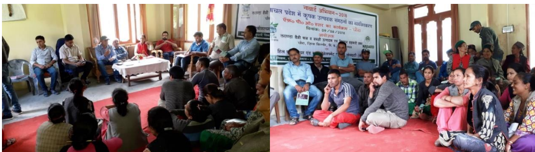
Fig 13. NABARD campaign – Strengthening of FPO Taranda Valley – Chaura was organised on 9 th and 10 th August 2018 at Taranda and Bari gram panchayats, district Kinnaur.

organized at Chaura, gram panchayat Taranda at Neogalsari and gram panchayat Bari, district Kinnaur on 9 th and 10 th August, 2018. As a result of this campaign the number of shareholders of this FPO increased vis-à-vis the equity of the FPO has also increased.