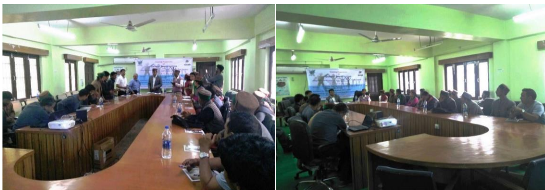
Fig 1. Gender sensitization camp organized for the farmers and farm women of Nathpa gram panchayat on 16 th May, 2018 at Bhabanagar, Kinnaur.