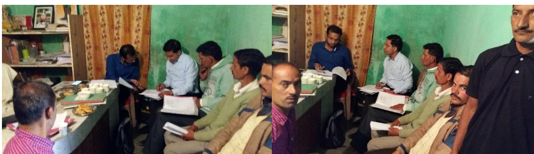
Fig 6. Meeting of PMRC-cum-training organized on 16 th October 2018 to review the progress of FPO Devi Kot – Balindi and FPO Subzi Utpadak – Bhanoti at Karsog, district Mandi.