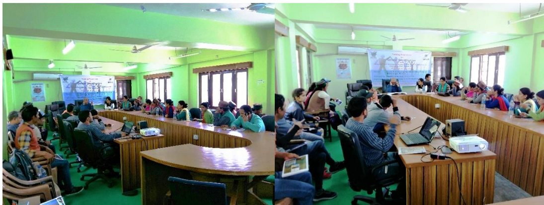
Fig 2. Gender sensitization camps organized for the farmers and farm women of Chhota Kamba and Rupī gram panchayats on 17 th & 18 th May 2018 at Bhabanagar, Kinnaur.

From Nathpa 38 farmers and farm women attended the camp held on 16-05-2018, from Chhota Kamba only 15 farmers and farm women could participate in the camp held on 17-05-2018 whereas 29 farmers and farm women from Rupī attended the camp on 18-05-2018. In these camps the beneficiary farmers and farm women were sensitized about changing behavior and instilling empathy into the views that we hold about our own and the other genders.