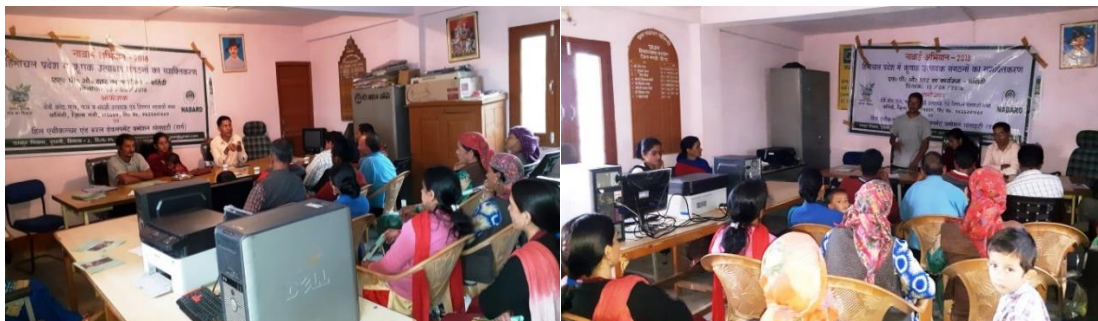
Fig 11. NABARD campaign – Strengthening of FPO Devi Kot – Balindi was organised on 13 th , 14 th & 15 th August 2018 at Balindi, Kheel and Kanda gram panchayats, district Mandi.

shareholders of this FPO increased vis-à-vis the equity of the FPO has also increased.