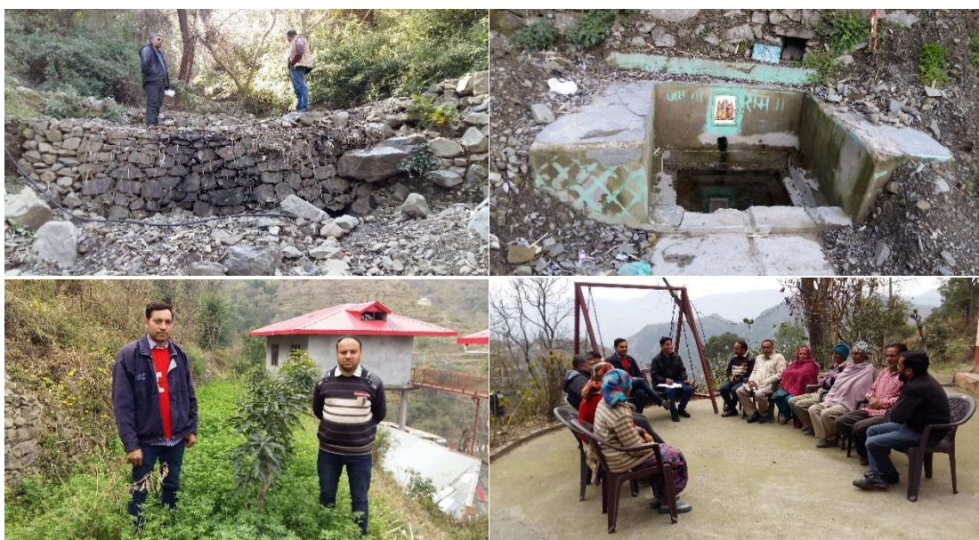
Fig 15. Glimpses of field verification of a study – Impact Evaluation of Daseran Watershed Project in Solan district.