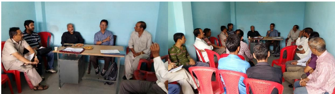
Fig 5. Meeting of PMRC-cum-training organized on 14 th July 2018 to review the progress of FPO Shubham at village Galot, District Shimla.

was reviewed. The farmers were also trained in aggregation and marketing of their produce. Total 33 shareholder farmers participated in this meeting. The DDM, NABARD district Shimla has chaired the meeting.