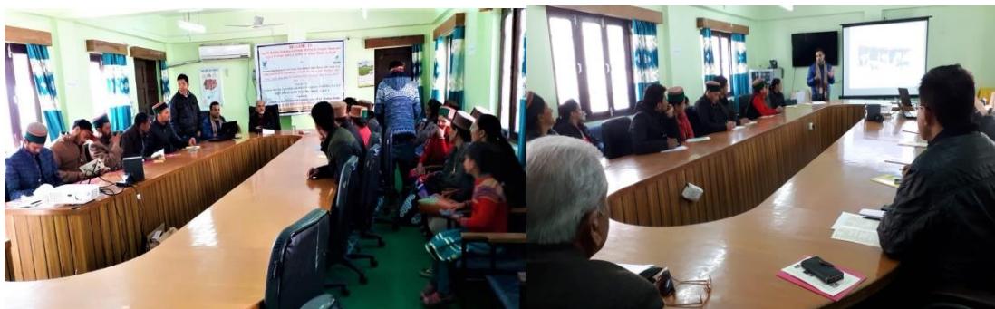
Fig 4. Capacity building workshop on Animal Nutrition & Livestock Management organised on 24 th December 2018 for farmers of Chhota Kamba, Rupri and Nathpa gram panchayats at Bhabanagar, Kinnaur.

workshop. A documentary film on dairy farm management was also shown to the participants.