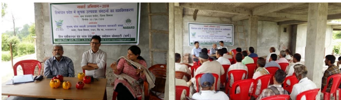
Fig 9. NABARD campaign – Strengthening of FPO Shubham – Galot was organised on 3 rd & 4 th August, 2018 at Galot, Shimlaghat and Bhaloh gram panchayats, district Shimla.