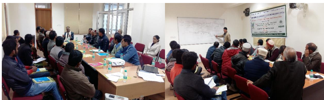
Fig 8. Two days training for the BoDs of six FPOs organized on 6 th & 7 th December 2018 in Shimla.