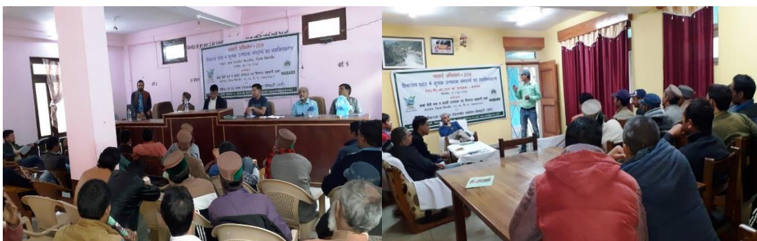
Fig 14. NABARD campaign – Strengthening of FPO Bhaba Valley – Katgaon was organised on 7 th and 8 th August 2018 at Katgaon and Yangpa gram panchayats, district Kinnaur.