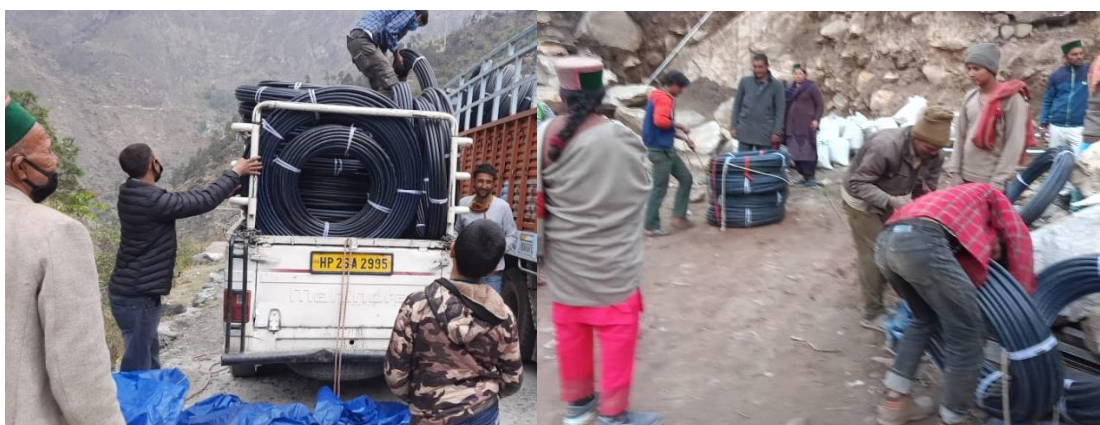
Figure 2. Distribution of irrigation pipes to carry water from water storage tanks to wadis.

Irrigation pipes provided to wadi farmers – For taking water from distribution tank to the fields (wadis) the PIA have provided 20 mm HDPE pipes measuring 77800 m length to 321 wadi farmers (out of 598 farmers) on 50% farmers contribution and 50% grant fund. Rest of the wadi farmers were having their own arrangements to irrigate their fruit plants