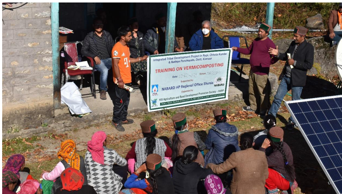
Figure 7. Training of farmers on procedure & preparation of vermicomposting at village Majhgaon.

Training of farmers on post-harvest handling (horti) – Total 10 trainings on post-harvest handling of apple fruit crop were organized covering the wadi beneficiaries of all villages of the project area. The main objective of the trainings was to make the farmers aware on post-harvest handling of apple fruit crop. The trainings were also aimed to train the farmers on carrying out different operations in apple fruit crop at the time of maturity of fruits. During these trainings the wadi farmers were also trained in fruit plucking management.