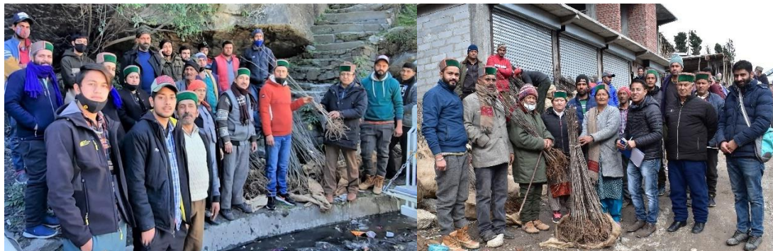
Figure 19. Distribution of apple plants to the farmers of Bari & Tranda Panchayats, district Kinnaur by DDM NABARD and representatives of gram panchayats.

Procurement and distribution of apple plants – Total 20250 apple plants of main varieties (Jeromine, Red Velox, King Roat & Scarlet-II) and pollinizer varieties (Dark Baron Gala, Redlum Gala, Gale Gala, Granny Smith & Schnico Gala) were procured from Dr. Y.S. Parmar University of Horticulture & Forestry and from a private Nursery at District Solan. The plants were distributed to 124 farmers of Bari and Tranda gram panchayats, district Kinnaur on 7 th and 8 th January 2022. To treat the plants, Bavistin was also given to these farmers on 50% subsidy.