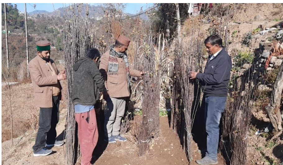
Figure 18. Nursery inspection team inspecting the apple nursery at Dharon-Ki-Dhaar, Solan.

Inspection of apple nursery – Before the procurement of apple plants a nursery inspection team has inspected the nursery at Dharon-Ki-Dhaar, Solan on 24 th and 25 th December 2020. This team was constituted with the representatives from PIA, PTDC, VPCs and expert (HDO) from Department of Horticulture. After inspection, the planting material was purchased from the nursery grower.