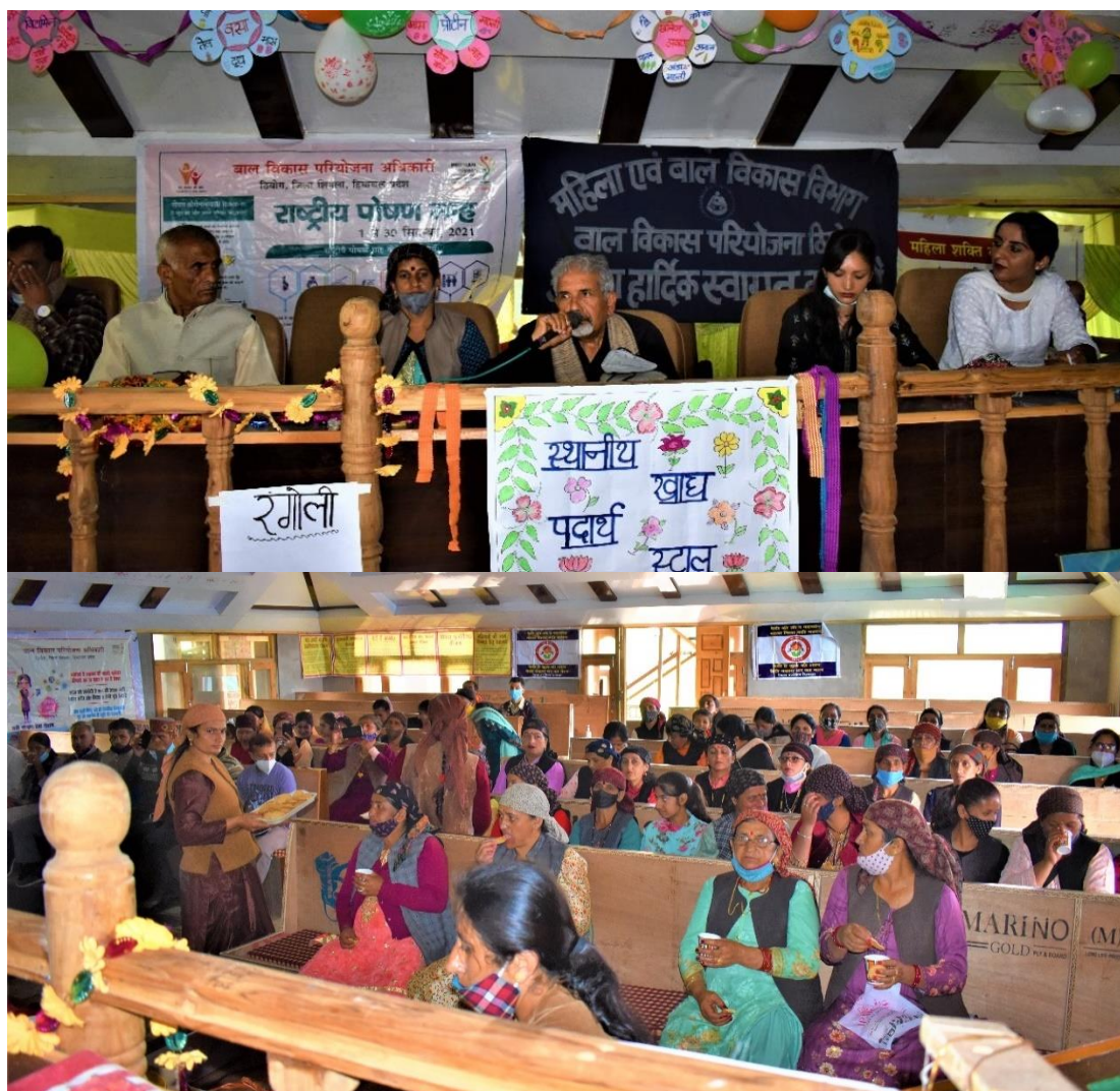
Figure 28. The Chairman, HARP addressing the participants of Awareness Camp on Women and Child Nutrition Management on 22 nd September 2021 at Gram Panchayat Ghoond, District Shimla.