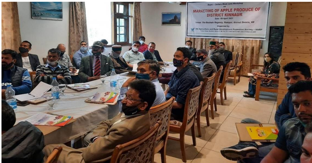
Figure 24. Delegates present in the buyer–sellers meet-cum-workshop at Rampur Bushahr, district Shimla.

Celebration of International Day for Biological Diversity – With the collaboration of Nathpa Jhakri Hydro Power Station (NJHPS) of SJVN an awareness camp to celebrate the International Day for Biological Diversity was organised by HARP on the 22 nd May, 2021 at village Kafour, Gram Panchayat Chaura, District Kinnaur, Himachal Pradesh. The main objectives to organise this awareness camp were to create awareness among the rural people regarding the biodiversity, its importance and benefits and to aware them about the importance of celebrating International Day of Biological Diversity.