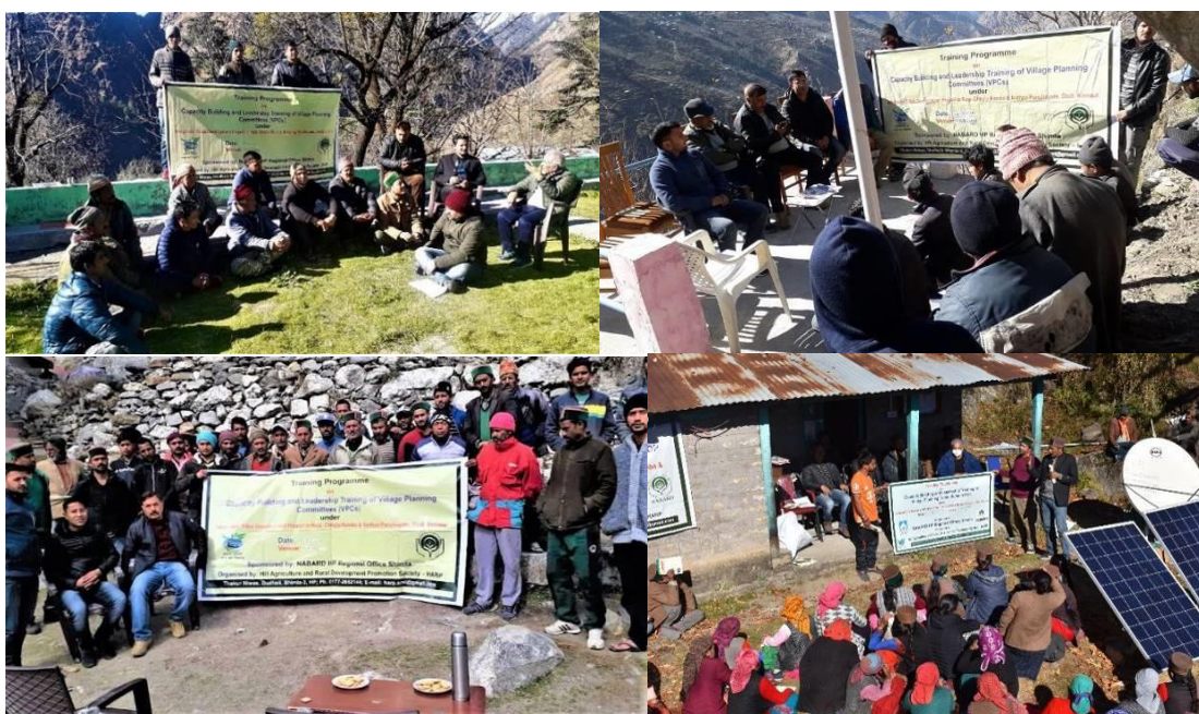
Figure 3. Glimpses of VPCs trainings held at different venues.

Capacity building-cum-leadership programmes to VPCs – During the FY 2021-22 total 15 capacity building-cum-leadership programmes were organised for the BODs and other members of 15 village planning committees (VPCs) of the project area. During these programmes the BODs and members of VPCs were made aware on their role & responsibilities and functions of VPCs. They were also get trained in resource mobilization, conflict management, record keeping, leadership and monitoring.