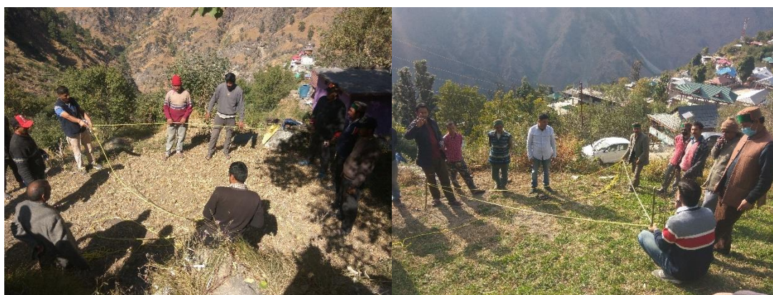
Figure 16. Skill Development Training in Layout Plan of Orchards and Digging & Filling of Pits held at Chaura and Bari, District Kinnaur.

Two skill development trainings in layout plan of orchards, size of pits, digging of pits and filling of pits were organised on 7 th to 8 th January 2022 at Chaura and Bari in which 124 wadi farmers participated. In these trainings the skill of Wadi farmers who were selected for plantation of apple plant saplings during 2 nd year of the project was developed. The farmers were demonstrated the distance between plant to plant to be maintained with the help of rope and measuring tape. The farmers were also given demonstration regarding the size of pit (1*1*1 meters) to be kept and how and when it is to be filled before the plantation of apple saplings.