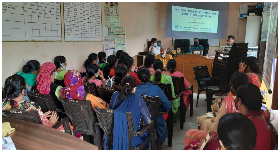
Figure 26. The Chairman, HARP addressing the participants of Sensitization/Orientation Workshop on 15 th July 2021 at Gram Panchayat Bhont, District Shimla.

Sensitization/Orientation Workshops for the Cattle Milk Producers – With the coordination of Gram Panchayat Bhont, HARP voluntarily organised two sensitization/orientation workshops for farm women of this Panchayat on the 7 th and 15 th July 2021 in the premises of Gram Panchayat Bhont. On 7 th July 2021 total 7 Panchayat Representatives including President, Vice President, Panchayat Secretary and Ward Members were present and on 15 th July 2021 total 26 farm women and representatives of the Panchayat were present in the programme. The main objectives of the workshops were to sensitize the cattle milk producers of the area regarding forming an organization like FPO or milk producer organization (MPO) and to aware them about the merits of FPO and its advantages to the community in boosting their economy & also to solve their problems collectively being faced by the milk producers farm women.