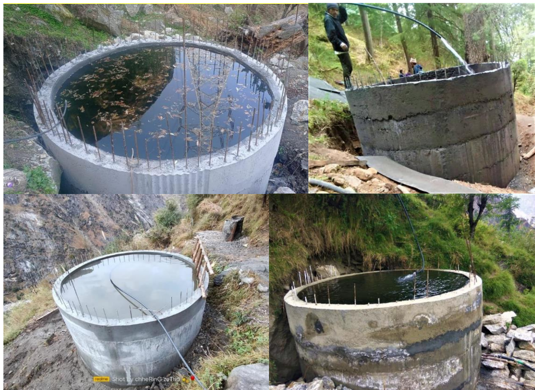
Figure 14. Water storage tanks constructed to irrigate apple orchards at Chaura, Thach and Kafour villages in Tranda panchayat, District Kinnaur.

Installation of Drip Irrigation System – Under the project total 60 Wadis have been covered under Drip Irrigation System in Chaura and Tranda Panchayat area. The material of Drip Irrigation System for next 60 Wadis have been procured and will be installed soon.