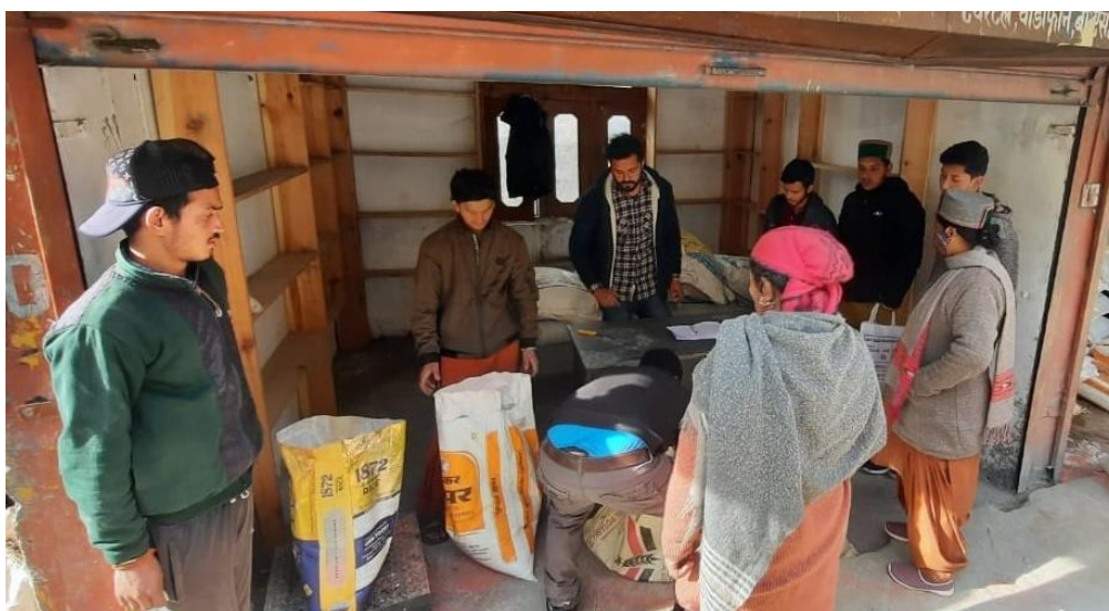
Figure 20. Distribution of fertilizers (MOP & SSP) to the Wadi farmers.

Distribution of fertilizers – Fertilizers like Muriate of Potash (MOP) and Single Super Phosphate (SSP) were distributed on 18 – 20 January 2022 to all 244 Wadi farmers to whom apple plants were given during the planting season of 1 st and 2 nd year.