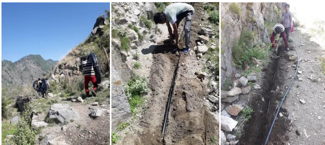
Figure 1. Carriage and laying of HDPE pipes.

the year 2021-22 two wadi farmers have come forward to take up this component. Now there are total 39 wadi farmers in the project area who have installed drip system of irrigation in their wadis.