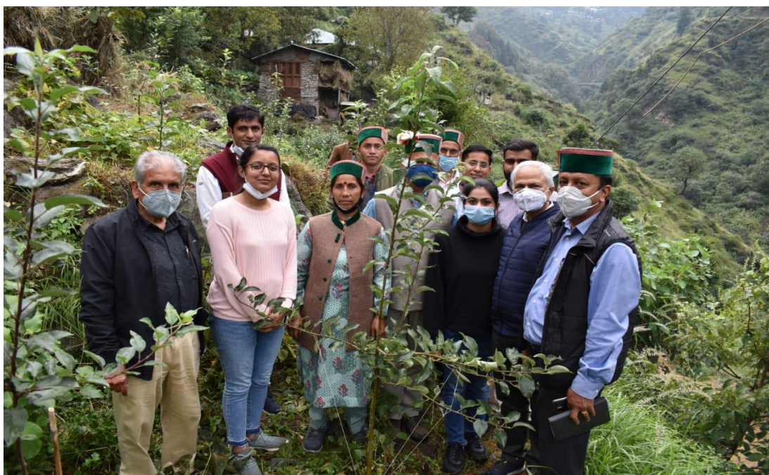
Figure 21. Monitoring of Wadis (orchards) by the CGM NABARD, HP RO Shimla.

Monitoring of Project by Senior Officers of NABARD – The project activities are being regularly monitored by DDM NABARD Kinnaur. The Chief General Manager, NABARD, HP Regional Office, Shimla also visited the Project area (gram panchayat Tranda) on 2 nd October 2021 along with other officers. During this visit the CGM NABARD while monitoring the performance of wadi establishment also interacted with the Wadi farmers of Taranda and Chaura gram panchayats