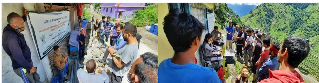
Figure 9. Training of wadi farmers on apple grading and packaging held at Bara Kamba & Karchrag.

apple fruits, if supplied in the markets, then it can fetch good price of apple fruits and benefit the farming community. Keeping in view the importance of grading and packaging of apple, the wadi farmers were imparted training on these topics. Total two trainings were organised on grading and packaging of apple under the Project.