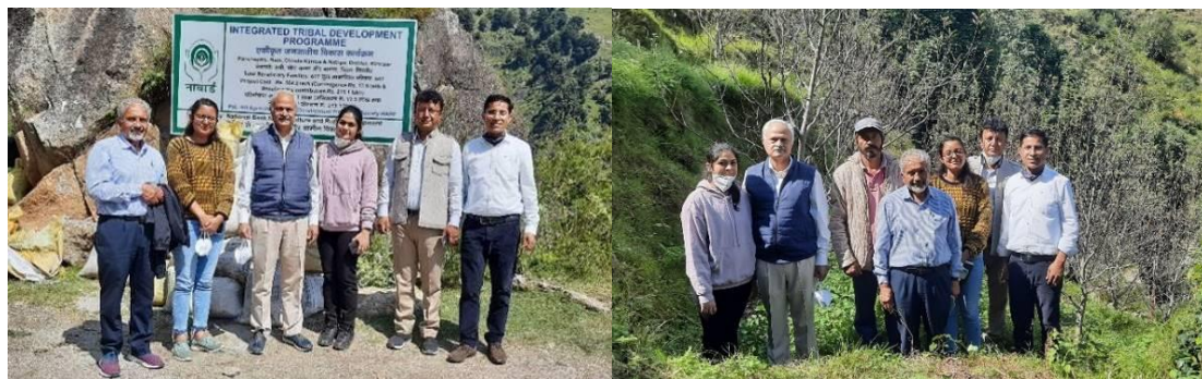
Figure 13. Monitoring of project activities by the CGM and DDM from NABARD.

Monitoring of Project by Senior Officers of NABARD – The project activities are regularly being monitored by DDM NABARD Kinnaur. The Chief General Manager, NABARD, HP Regional Office, Shimla also has visited the Project area (gram panchayat Rupi) between 3 rd and 4 th October 2021. During his visit he has interacted with the Wadi farmers and also visited some orchards established under the project.