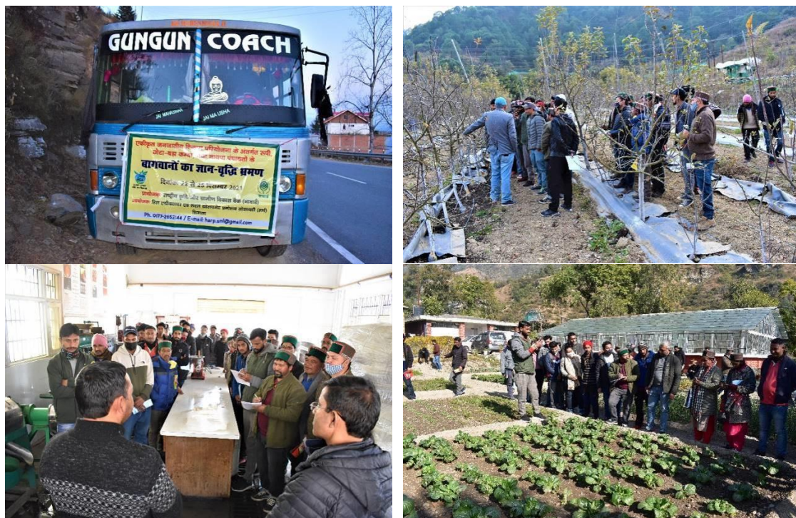
Figure 12. Exposure visit of FPO members held at different demonstration sites of Dr. Y.S. Parmar University of Horticulture and Forestry (UHF), Nauni, district Solan, Himachal Pradesh.

Monitoring of Project by Senior Officers of NABARD – The project activities are regularly being monitored by DDM NABARD Kinnaur. The Chief General Manager, NABARD, HP Regional Office, Shimla also has visited the Project area (gram panchayat Rupi) between 3 rd and 4 th October 2021. During his visit he has interacted with the Wadi farmers and also visited some orchards established under the project.