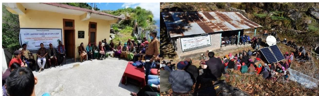
Figure 8. Training of wadi farmers on post-harvest handling held at Bara Kamba and Rupri villages.

Training of farmers on post-harvest handling (horti) – Total 10 trainings on post-harvest handling of apple fruit crop were organized covering the wadi beneficiaries of all villages of the project area. The main objective of the trainings was to make the farmers aware on post-harvest handling of apple fruit crop. The trainings were also aimed to train the farmers on carrying out different operations in apple fruit crop at the time of maturity of fruits. During these trainings the wadi farmers were also trained in fruit plucking management.