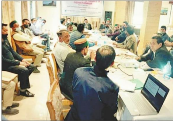
रामपुर में आयोजित जागरूकता शिविर में भाग लेते किन्नौर जिले के बागवान।

सेब की पैकिंग, गुणवत्तायुक्त सेब तैयार करने सहित खरीद की दी जानकारी