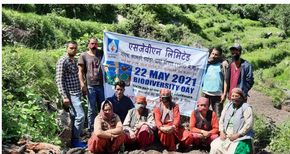
Figure 25. Villagers of village Kafour celebrating International Day for Biological Diversity on 22 nd May 2021 at village Kafour, District Kinnaur.

Celebration of International Day for Biological Diversity – With the collaboration of Nathpa Jhakri Hydro Power Station (NJHPS) of SJVN an awareness camp to celebrate the International Day for Biological Diversity was organised by HARP on the 22 nd May, 2021 at village Kafour, Gram Panchayat Chaura, District Kinnaur, Himachal Pradesh. The main objectives to organise this awareness camp were to create awareness among the rural people regarding the biodiversity, its importance and benefits and to aware them about the importance of celebrating International Day of Biological Diversity.