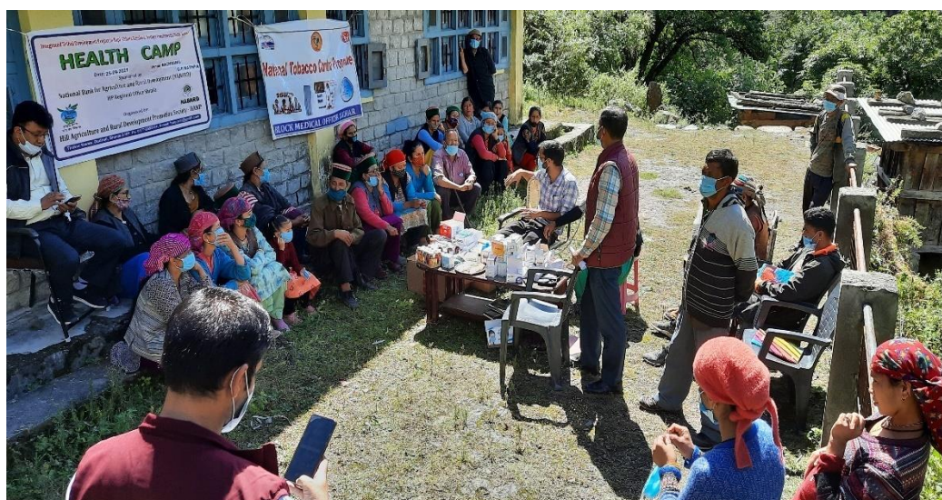
Figure 10. Health camp organised at village Kachrang, gram panchayat Nathpa.

Health camps for children, women and elderly – One health camp under the project was organized in collaboration with Community Health Centre (CHC) Bhabanagar on 25/09/2021 at village Kachrang of gram panchayat Nathpa. During health camp the people were clinically checked by a Medical Doctor on general health in general and blood pressure, blood sugar level, etc. in particular. The patients were also given free medicines as per requirement out of grant fund. The people who came for general check-up were also given a few health tips by the Doctors.