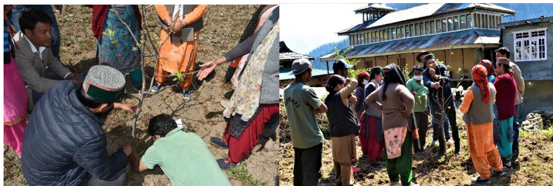
Figure 4. Visits of KVK Scientists in the orchards of the wadi beneficiaries at Rupī on 28 th and 29 th March 2022.

in situ . The scientists, therefore, made three visits to the project area. During these visits the scientists on the basis of their observations gave on the spot technical advice to the farmers.