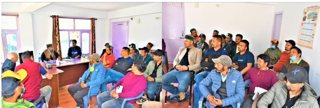
Figure 11. Orientation-cum-training of BODs, CEO and members of Farmer Producer Organization (FPO) held at Project Office, Bhabanagar, Kinnaur.

Orientation and training programme for FPO – Under the Project one orientation-cum-training programme was organised for the BODs, CEO and members of the FPO on 24/03/2023 at the Project Office of PIA at Bhabanagar, district Kinnaur. In this training programme the members of FPO were made aware about the basic activities of FPO like aggregation & marketing of produce, supply of inputs, making provision of services to the member farmers, etc. During these trainings the BODs and CEO were also informed about their roles and responsibilities. During the training discussion was also held on organizing different kind of meetings of the FPO, procedure of preparing different licenses to purchase and sale of agri-horticulture inputs and preparation of business development plan. The basics of financial management, accounting and funding arrangement in FPO were also taught to the CEO, BODs and members of FPO.