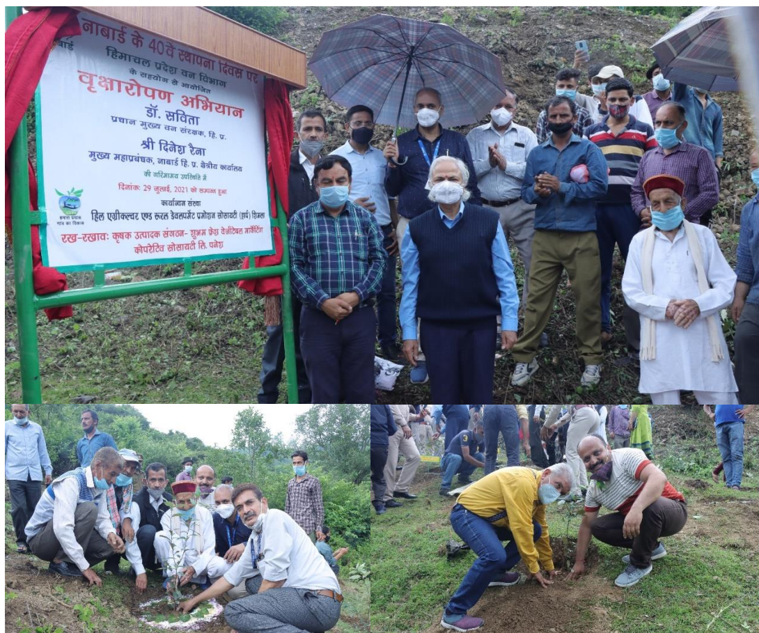
Figure 27. Celebrating Van Mahotsav on 29 th July 2021 at Village Phagera, District Shimla on the occasion of State Level celebration of 40 th Foundation Day of NABARD.