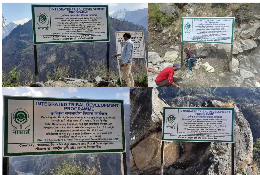
Figure 6. Field display boards installed at different locations in the Project area.

Display boards – Under the project four display boards having information about the Project and its financial details were fixed in the project area during the year. Out of these four field display boards, three boards were fixed at the panchayats level and one display board was erected at the national highway (NH) 5 (near Chaura village).