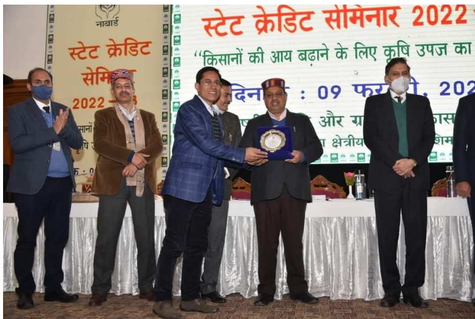
Figure 29. HARP conferred on best POPI for 2021-22 by NABARD in the State Credit Seminar 2022-23 on 9 th February 2022 at The Peterhof, Shimla.