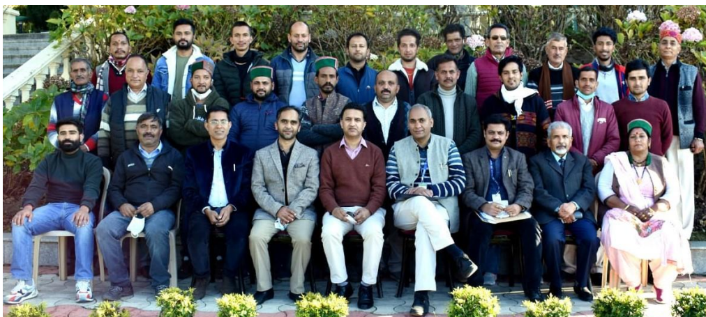
Figure 22. Participants of Capacity Building Training Programme organised for BODs and CEOs of six FPOs at HIPA, Shimla.

Training of BODs and CEOs – A capacity building training of BODs and CEOs of 6 FPOs (4 FPOs promoted by HARP and 2 FPOs directly promoted by NABARD) , like ; Shubham Fresh Vegetable Growers Marketing Cooperative Society Ltd., Village Panesh, District Shimla, Subzi Utpadak Cooperative Society Ltd., Bhanoti, District Mandi, Bhaba Valley Fruit and Vegetable Production and Marketing Cooperative Society Ltd., Katgaon, District Kinnaur, Bari Fruit and Vegetable Grower cum Marketing Cooperative Society Ltd., VPO Bari, Teh. Nichar, District Kinnaur, Sapteshwar Maharaj Fruit & Vegetable Producer Marketing Co-operative Society Ltd., Theog, District Shimla and Satyam Farmer Fruit and Vegetable Producer & Marketing Cooperative Society Ltd., Theog, District Shimla was organised by HARP from November 08 to 12, 2021 at Himachal Pradesh Institute of Public Administration (HIPA), Fairlawn, Shimla. Total 26 participants (CEOs & BODs) actively participated in this training programme.