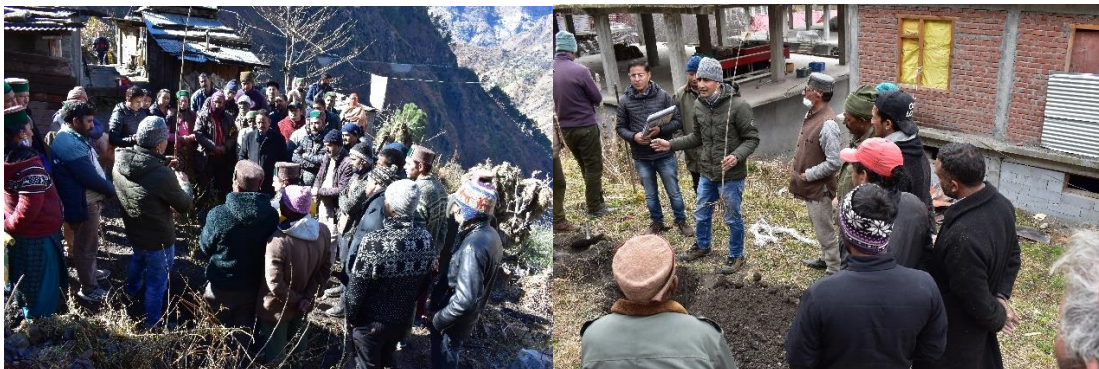
Figure 17. Skill Development Trainings in Method of Planting of Apple Plants held between January 7-8, 2022 at Chaura and Bari, district Kinnaur.

Skill Development Trainings in Basin Preparation, Manure and Fertilizer Application – Before the distribution of apple plants to 124 wadi farmers of Tranda and Bari panchayats, total three skill development trainings in Basin preparation, manure and fertilizer application were organised on 7 th and 8 th January 2022 at village Chaura and Bari villages.