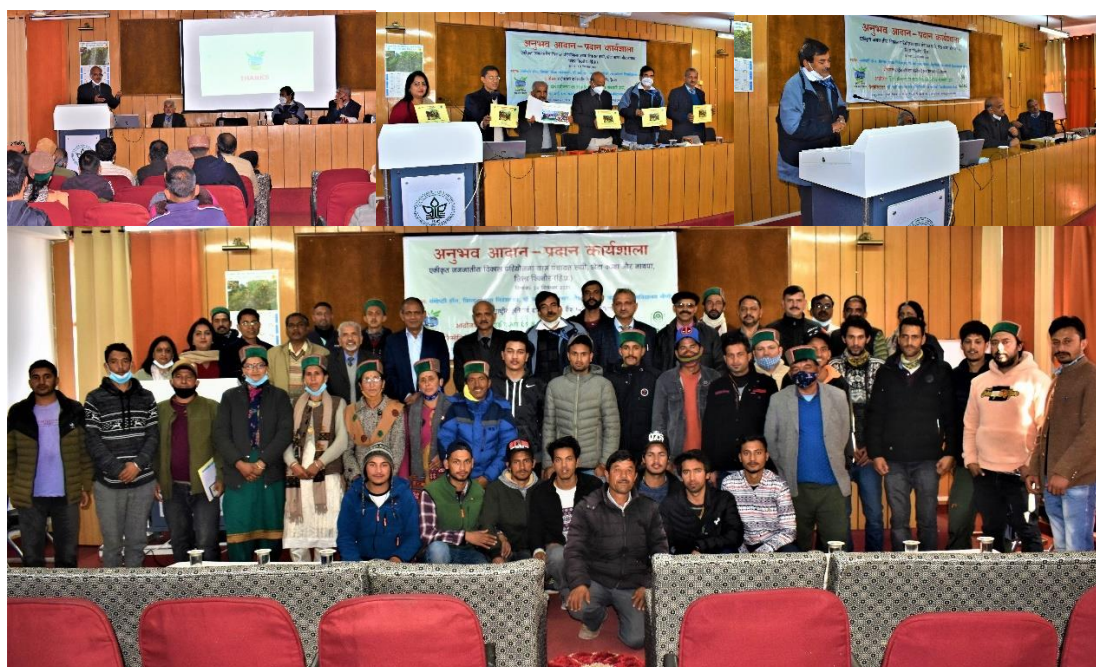
Figure 5. Glimpses of experience sharing workshop held at UHF Nauni, Solan, Himachal Pradesh.

Experience sharing workshop – Experience sharing workshop – One experience sharing workshop was organised on December 24, 2021 at Dr. Y.S. Parmar University of Horticulture and Forestry (UHF), Nauni, Solan. In the workshop the wadi farmers had a chance to interact with the scientists of UHF Nauni. The senior officers of NABARD were also there in the workshop to observe the progress made