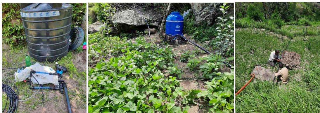
Figure 15. Drip Irrigation System installed in the orchards (wadis).

Installation of Drip Irrigation System – Under the project total 60 Wadis have been covered under Drip Irrigation System in Chaura and Tranda Panchayat area. The material of Drip Irrigation System for next 60 Wadis have been procured and will be installed soon.