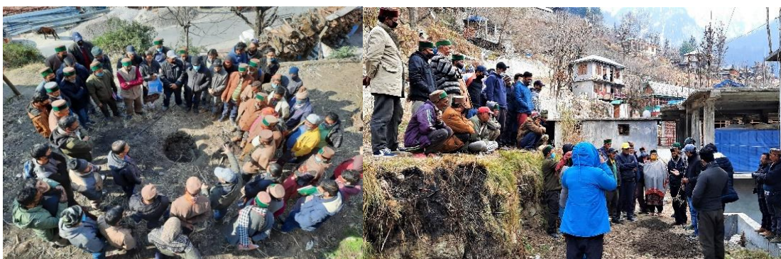
Figure 8. Skill Development Trainings in Method of Planting of Apple Plants held between January 28 to 30, 2021 at Chaura and Bari, District Kinnaur.

Skill Development Training in method of planting of Apple plants – Five skill development trainings in method of planting of apple plant saplings were organized on 28 th to 30 th January 2021 at two venues. In these trainings the farmers were demonstrated the method of planting of apple saplings. Before planting the apple saplings the pit soil was mixed with the muriate of potash and superphosphate fertilizers and FYM.