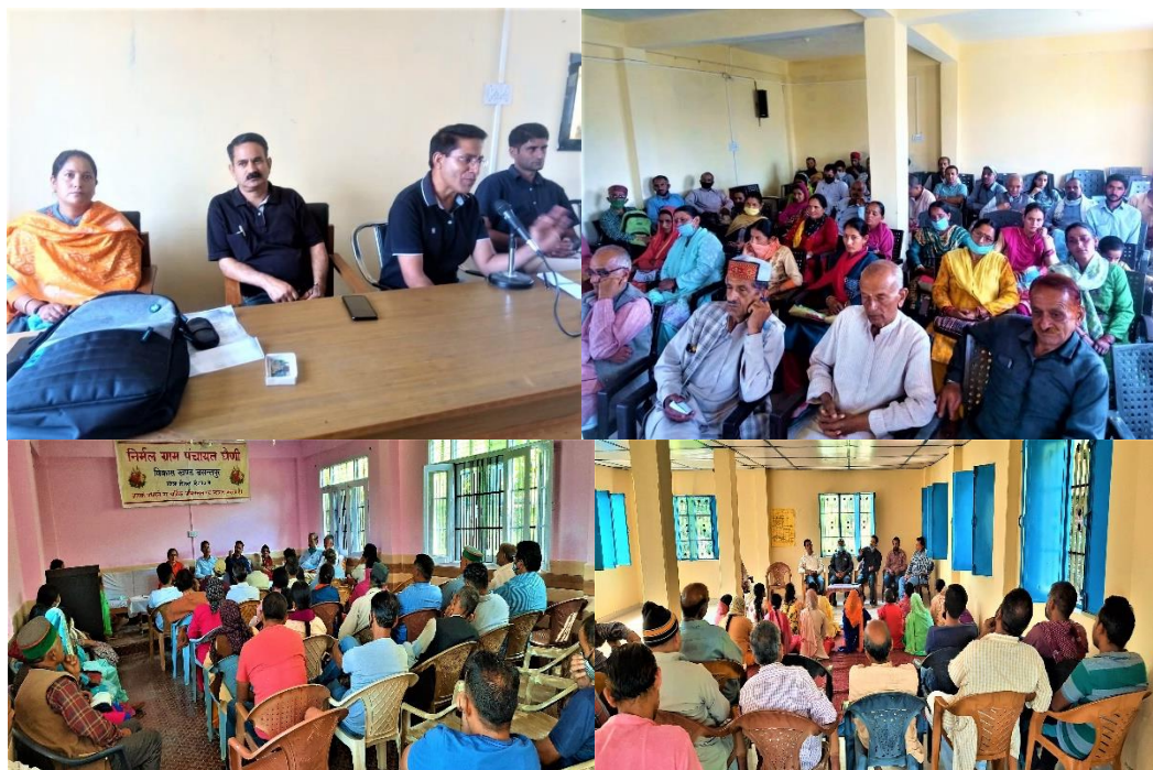
Figure 18. Glimpses of mobilization camps on organizing farmers in FPO(s) at Pahal, Ghaini & Nehra Gram Panchayats of District Shimla.

Mobilization Camps on Organizing Farmers in FPO - The HARP has organised three mobilization – cum – awareness camps on organizing agriculture farmers in Farmer Producer Organizations (FPOs). These camps were organized for the farmers of four gram panchayats viz; Pahal, Ghaini, Neen and Nehra of Development Block Basantpur, District Shimla from 28 th to 30 th September 2020. These camps were organized with the close coordination of the Subject Matter Specialist (SMS), Department of Agriculture (HP), Development Block Basantpur, District Shimla and PRIs - Gram Panchayats Pahal, Ghaini, Neen and Nehra of District Shimla. Total 75 farmers of Pahal panchayat, 42 farmers of Ghaini & Neen panchayats and 42 farmers of Nehra panchayat actively participated in these camps.