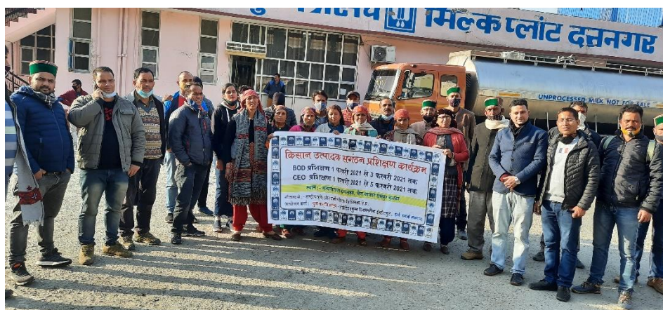
Figure 15. Exposure visit of BODs of the FPO in the Milk Processing Plant of HP MILKFED at Dutt Nagar, District Shimla on February 2, 2021.

Training of BODs – A capacity building training of BODs of the FPO- Bari Fruit and Vegetable Grower cum Marketing Cooperative Society Ltd., VPO Bari, District Kinnaur was organised by HARP from 1 st to 5 th February 2021 in collaboration with Yuva Jagrity Sangathan and SPARK at Rampur Bushahar, District Shimla, Himachal Pradesh. During this training programme an exposure visit of Milk Processing Plant of HP MILKFED at Dutt Nagar and CA Store of Reliance at Bithal was also conducted to give exposure to the BODs.