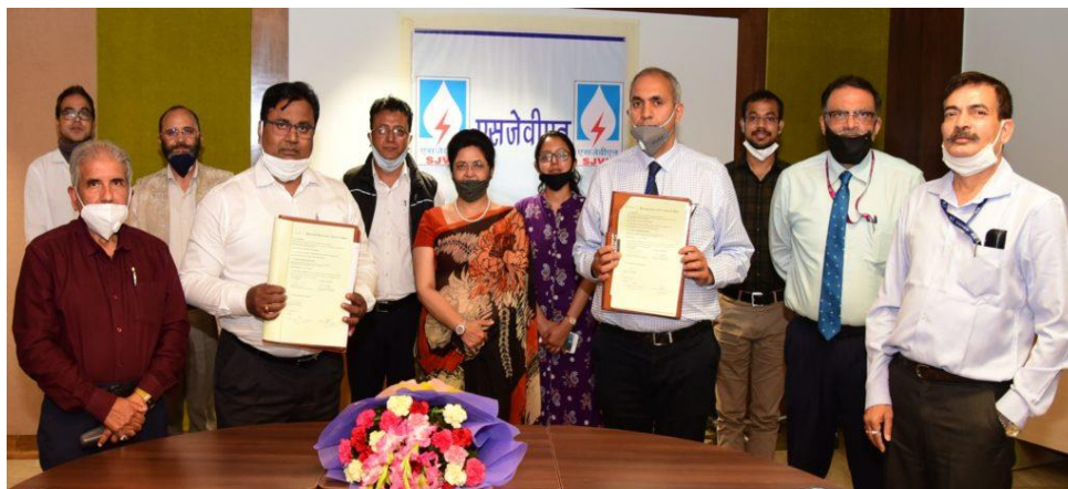
Figure 5. Signing of MoU between SJVN, NABARD and HARP on 7 July 2020 for the implementation Integrated Tribal Development Programme in Bari and Tranda gram panchayats of district Kinnaur.

Another programme of Integrated Tribal Development Programme in two (now three) gram panchayats of Nichar block, district Kinnaur, Himachal Pradesh, namely; Chaura, Tranda and Bari was signed during July 2020 between NABARD, SJVNL and HARP. It was awarded to HARP for implementation. Project is of six years which will remain operative upto 2026-27.