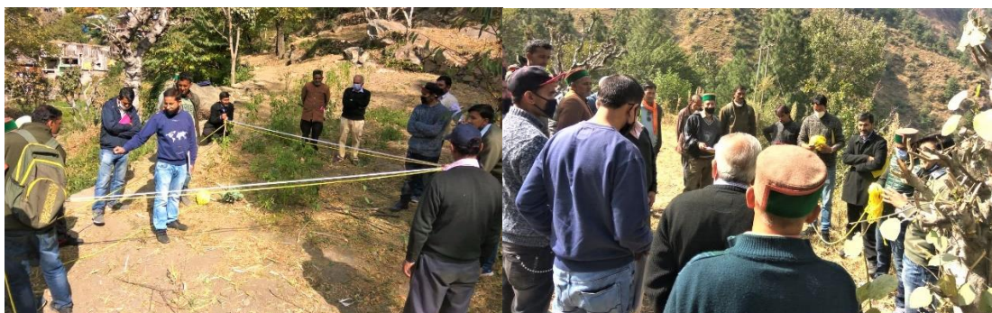
Figure 7. Skill Development Training in Layout Plan of Orchards and Digging & Filling of Pits held on October 28, 2020 at Nigulsari, District Kinnaur.

be kept and how and when it is to be half filled before the plantation of apple saplings.