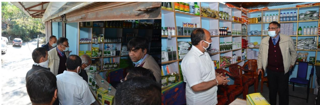
Figure 14. Monitoring of FPO – Shubham Fresh Vegetable Growers Marketing Cooperative Society Ltd., VPO Panesh, Distt. Shimla by Chief General Manager, NABARD on November 6, 2020.

Training of BODs – A capacity building training of BODs of the FPO- Bari Fruit and Vegetable Grower cum Marketing Cooperative Society Ltd., VPO Bari, District Kinnaur was organised by HARP from 1 st to 5 th February 2021 in collaboration with Yuva Jagrity Sangathan and SPARK at Rampur Bushahar, District Shimla, Himachal Pradesh. During this training programme an exposure visit of Milk Processing Plant of HP MILKFED at Dutt Nagar and CA Store of Reliance at Bithal was also conducted to give exposure to the BODs.