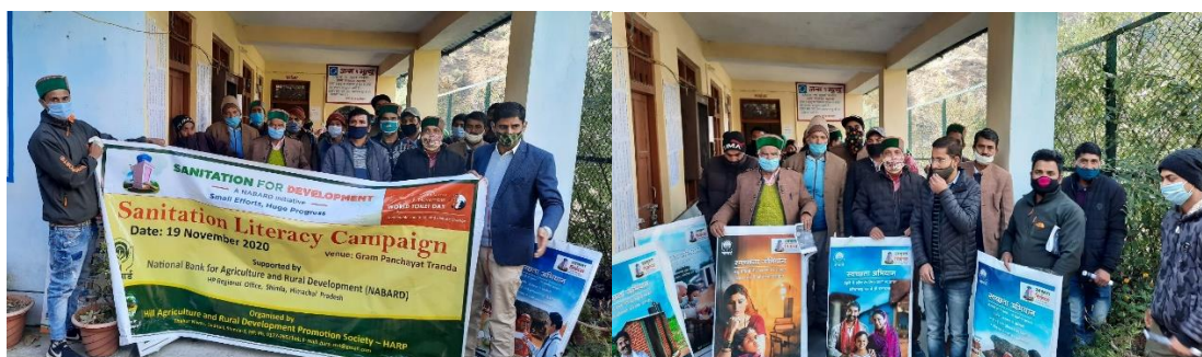
Figure 17. Glimpses of Sanitation Literacy Campaign organized on 19 th November 2020 at Nigulsari, District Kinnaur.

Sanitation literacy campaign – With the funding support of NABARD, HARP has organized a Sanitation Literacy Campaign on 19 th November 2020 at village Nigulsari, district Kinnaur, Himachal Pradesh. Total 63 people of three Gram Panchayats – Tranda, Chaura and Bari have actively participated in this campaign.