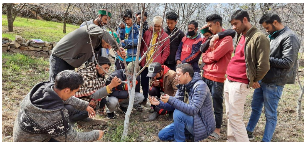
Figure 3. Scientists of KVK Sharbo, district Kinnaur giving on the spot technical advice to the Wadi farmers of Bara Kamba panchayat, District Kinnaur on 8 December 2020.

Technical support of KVK/UHF – During the FY 2020-21 the scientists of Krishi Vigyan Kendra (KVK) Sharbo, district Kinnaur made four visits to the project area. During these visits the scientists on the basis of their observations gave on the spot technical advice to the farmers.