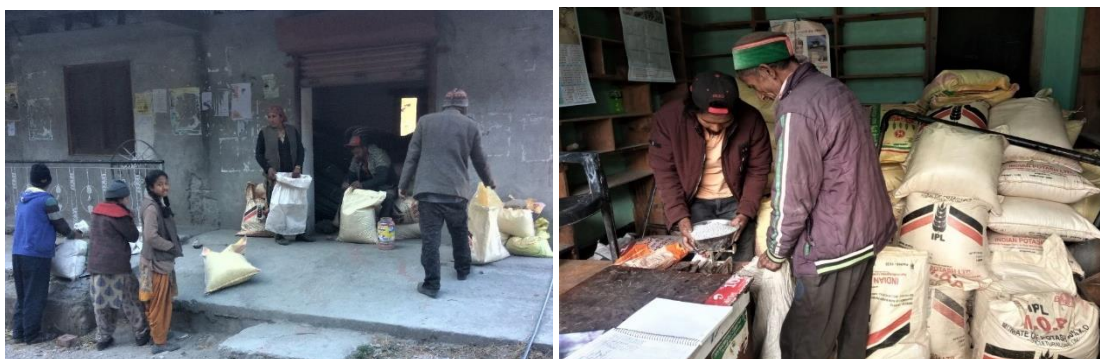
Figure 12. Distribution of fertilizers (MOP & SSP) to the Wadi farmers of Bari & Tranda Panchayats, District Kinnaur.

Distribution of fertilizers – The fertilizers like Muriate of Potash (MOP) and Single Super Phosphate (SSP) was also distributed from 10 th to 14 th February 2021 to those Wadi farmers to whom apple plants were given.