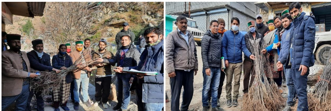
Figure 11. Distribution of apple plants to the farmers of Bari & Tranda Panchayats, District Kinnaur.

Gala and Granny Smith was procured from Dr. Y.S. Parmar University of Horticulture and Forestry, Nauni and from one private Nursery at Dharon-Ki-Dhaar, District Solan. The plants were distributed to 120 farmers of nine villages of Bari and Tranda gram panchayats, District Kinnaur in between 28 th to 30 th January 2021. To treat the plants, Bavistin was also given to these farmers on 50% contribution basis.