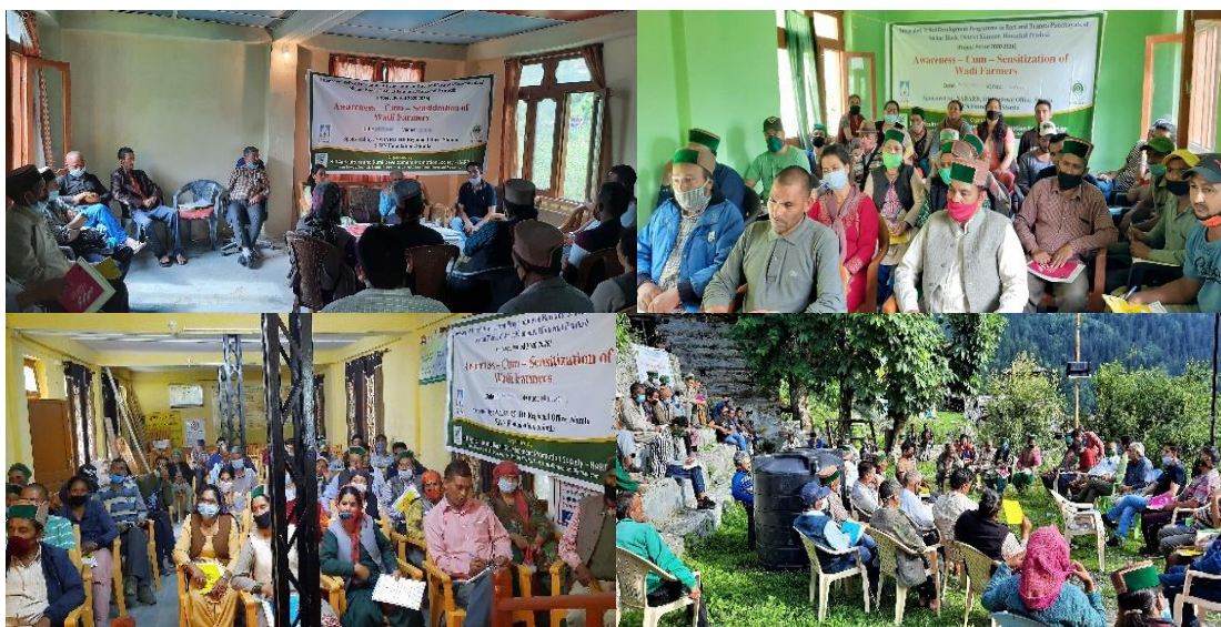
Figure 6. Wadi farmers sensitization program organized on July 30 and 31, 2020 at Chaura, Kafour, Nigulsari and Bari, District Kinnaur.

Formation of Village Planning Committees (VPCs) – During the sensitization camps/workshop seven VPCs were formed. Each VPC has one management committee comprising president, vice president, secretary, treasurer and 1-3 executive members. These VPCs will be working with the PIA staff and will ensure farmers participation in the implementation of the project. The president and secretary of each VPC will form Project level Tribal Development Committee (PTDC) which will work at project level with the PIA.