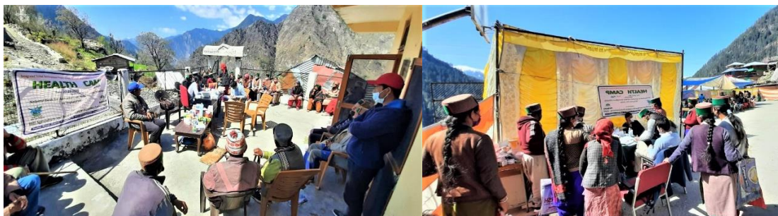
Figure 4. General health screening of the people of Rupri and Bara Kamba gram panchayats, District Kinnaur on 26 th and 27 th March 2021.

Health camps for children, women and elderly – Two health camps, one at Rupri and the other at Chhota – Bara Kamba were organised on 26 th March 2021 and 27 th March 2021. Total 106 persons in Rupri and about 105 persons in Chhota-Bara Kamba got themselves checked up.