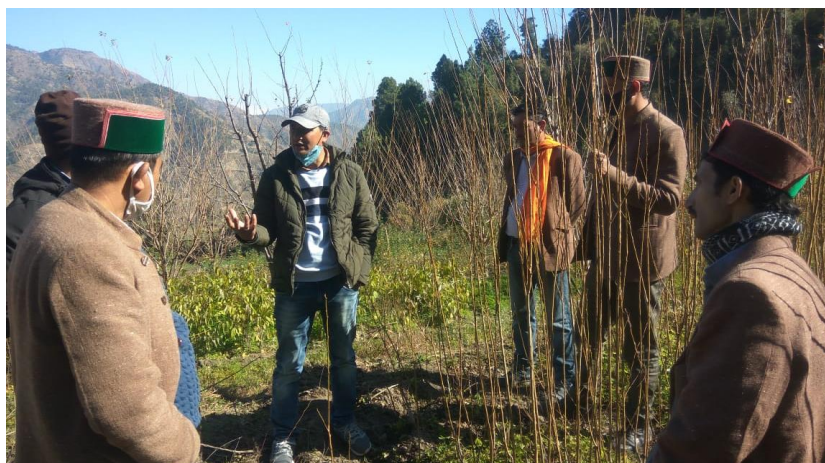
Figure 10. Nursery inspection team inspecting the apple nursery at Dharon-Ki-Dhaar, Solan.

Inspection of apple nursery – Before the procurement of apple plants a nursery inspection team has inspected the nursery at Dharon-Ki-Dhaar, Solan on 24 th and 25 th December 2020. In this team the representatives from PIA, PTDC, VPCs and expert (HDO) from Department of Horticulture was there. The team has found the apple plants in healthy condition and recommended to procure.