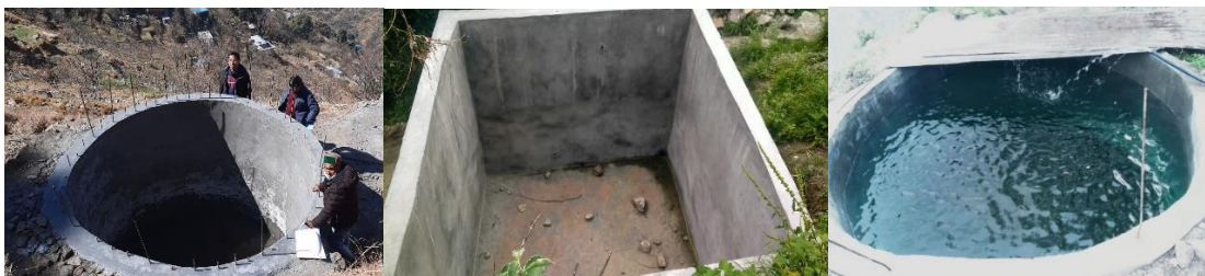
Figure 2. Water storage tanks constructed at Kachrang, Garshu and Kandhar villages.

PIA Staff Training – One PIA staff training was organized in the FY 2020-21. In this training the field works carried out are reviewed and further action plan for carrying out the implementation of project is prepared and discussed. The staff is trained about process of execution of the works.