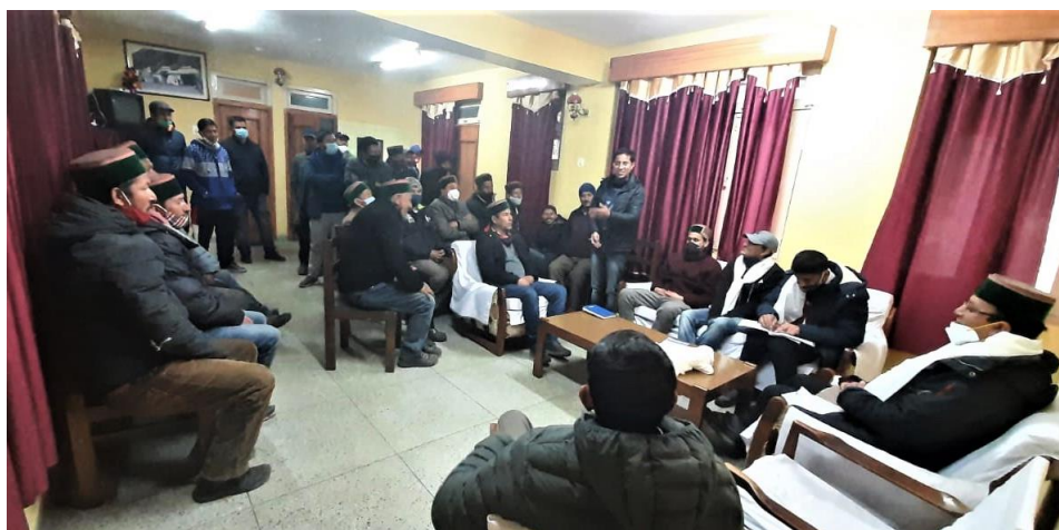
Figure 13. Project Monitoring Committee (PMC) meeting of FPO Bhaba Valley, Katgaon, District Kinnaur held on February 18, 2021.

Monitoring of FPOs and POPI – During the present year three Project Monitoring Committee (PMC) (on 27 th August 2020 (FN & AN), 18 February 2020) meetings of the FPOs were organized by HARP in which the officers from NABARD and line departments & banks, representatives of POPI and BODs, CEOs and members FPOs have actively participated. In these meetings the progress made by the FPOs and POPI was reviewed and future plans were discussed.