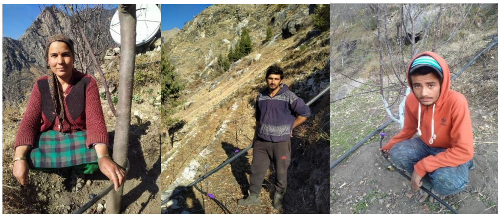
Figure 1. Drip Irrigation System installed by the Wadi farmers.

Water Resource Development (WRD) – Three water storage tanks for irrigating apple orchards were constructed during FY 2020-21. Now total 26 water storage tanks have been constructed under the Project.