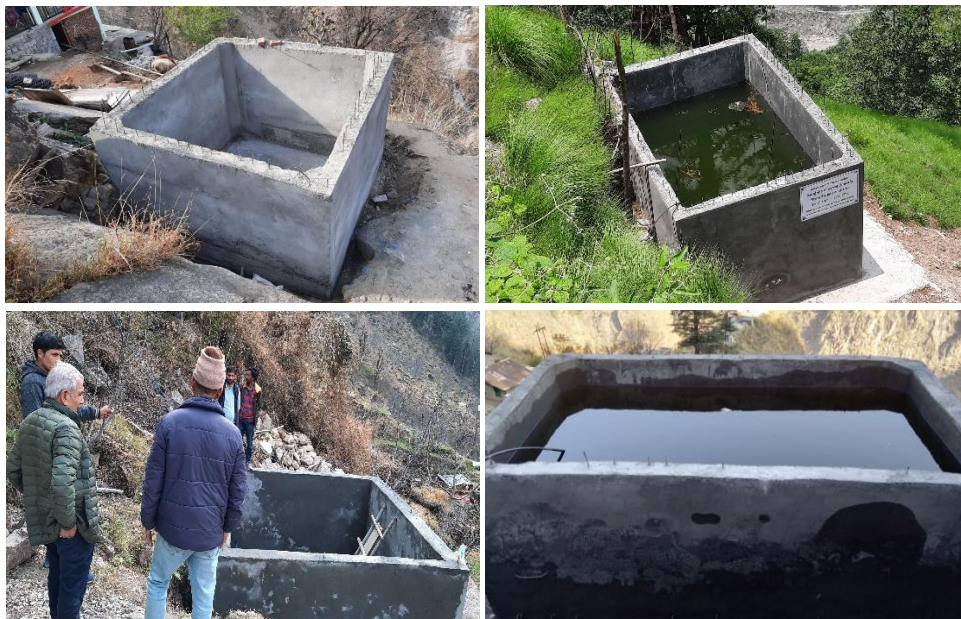
Figure 9. Water storage tanks constructed to irrigate apple orchards at Nigulsari, Nanspo, Chhonda and Kafour villages in Tranda panchayat, District Kinnaur.

Inspection of apple nursery – Before the procurement of apple plants a nursery inspection team has inspected the nursery at Dharon-Ki-Dhaar, Solan on 24 th and 25 th December 2020. In this team the representatives from PIA, PTDC, VPCs and expert (HDO) from Department of Horticulture was there. The team has found the apple plants in healthy condition and recommended to procure.