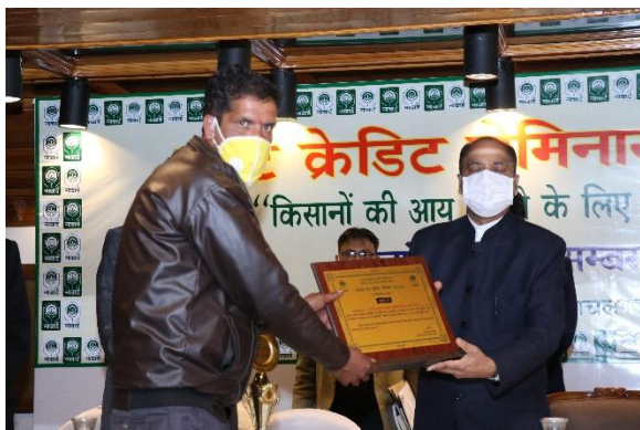
Figure 16. Best FPO award to FPO–Subzi Utpadak Cooperative Society Ltd., Bhanoti, Distt. Mandi conferred by the Chief Minister, Himachal in Credit Seminar of NABARD on December 15, 2020.

Seminar of NABARD on December 15, 2020 at Hotel Holiday Home Shimla.