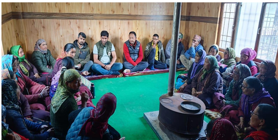
Figure 9. Meeting with the representative of Mahila Mandal & SHGs of Jobrang Gram Panchayat, Lahaul Valley, District Lahaul & Spiti.

A Programme on Promotion and Credit Linkages of Joint Liability Groups (JLGs) in Lahaul Valley of District Lahaul & Spiti, Himachal Pradesh from NABARD vide their letter No. NABARD/RB(HP)/533/MCID(JLG)/2022-23 on dated 10 th July 2023 for Rs. 2.00 Lakh was received. The implementation of this programme was started on 9 th Oct. 2023. First of all the stakeholders were made aware/sensitized about the programme w.e.f. 09-13 Oct. 2023 through holding eleven awareness camps. Thereafter, 32 joint liability groups were formed and organized.