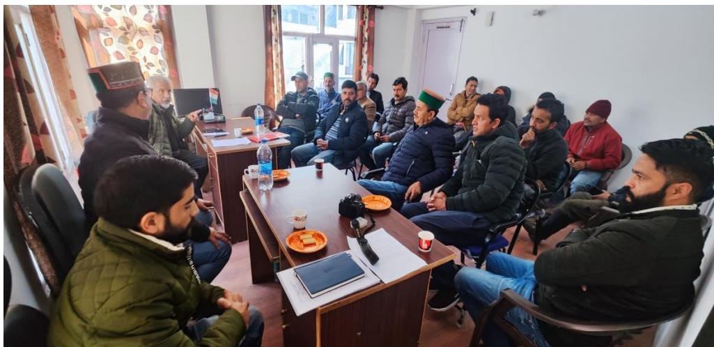
Figure 7. Project Monitoring and Implementation Committee (PMIC) meetings held on 19/01/2024.