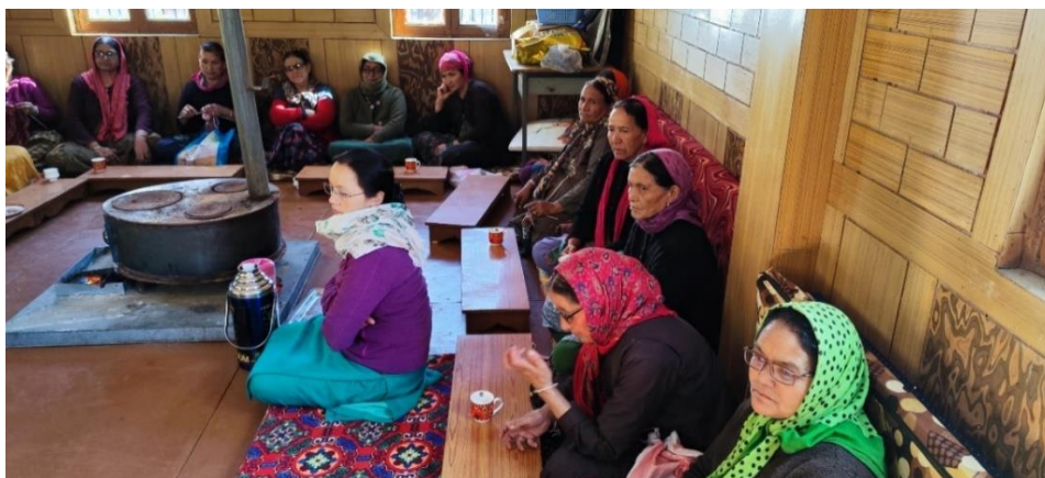
Figure 10. Meeting with the representative of Mahila Mandal & SHGs of Jahalma Gram Panchayat, Lahaul Valley, District Lahaul & Spiti

Another meetings with these 32 JLGs were held with w.e.f. 06-09 Nov. 2023 in which the trade/avocation these groups wanted to start, were discussed.