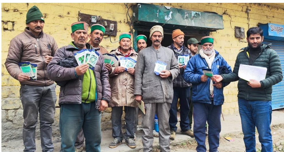
Figure 5. Distribution of inputs for the cultivation of off-session vegetable.