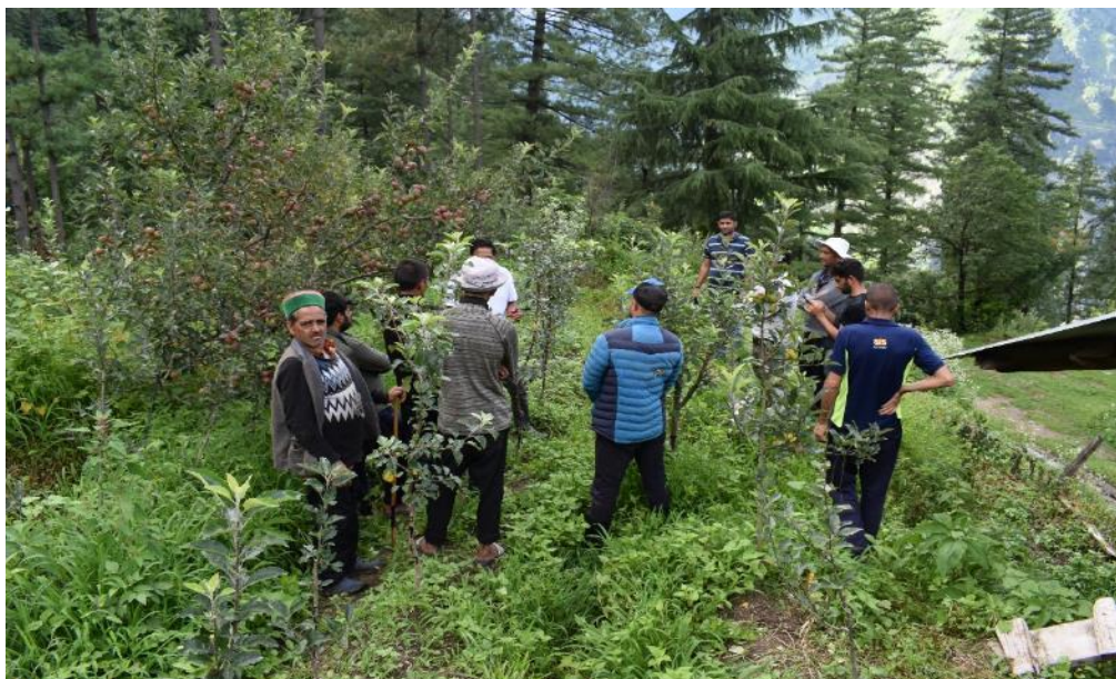
Figure 3. Scientists of KVK Sharbo, District Kinnaur giving on the spot technical advice to the Wadi farmers of the project area.