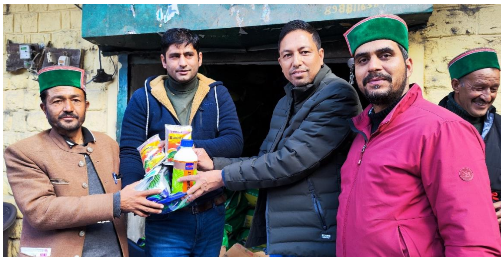
Figure 6. Distribution of inputs of plant (apple) protection material to the Wadi farmers.

For monitoring the implementation of project different tools have been adopted like sending quarterly/annual progress report, review meetings, visits of DDM and other senior officers of the NABARD etc.