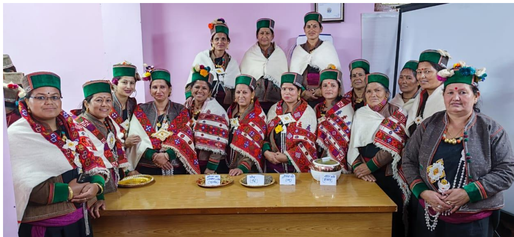
Figure 4. Training on woman and child nutrition management.

In order to support the 0.5 acre wadi farmers, for raising off season vegetables inputs like vegetable seeds, organic manures, pesticides, plastic crates & kilta (basket) were distributed on the dates given in table 3.