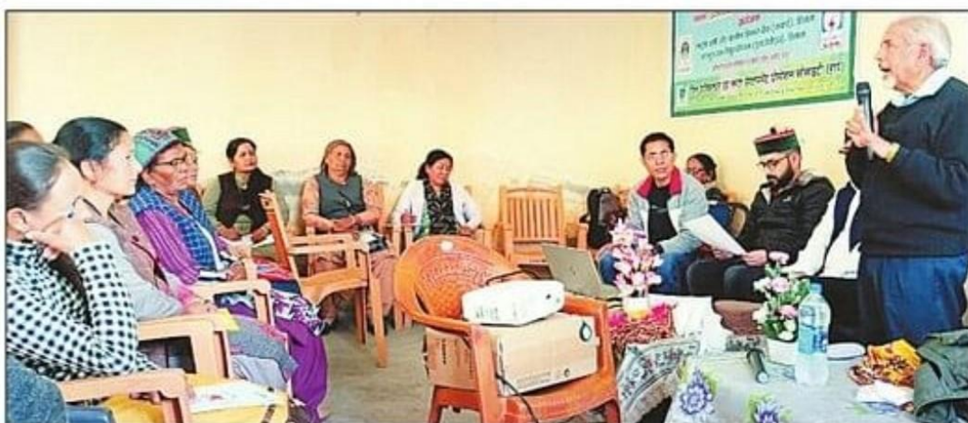
चौरा में महिला एवं बाल पोषाहार प्रबंधन शिविर में मौजूद तीन पंचायतों की महिलाएं।