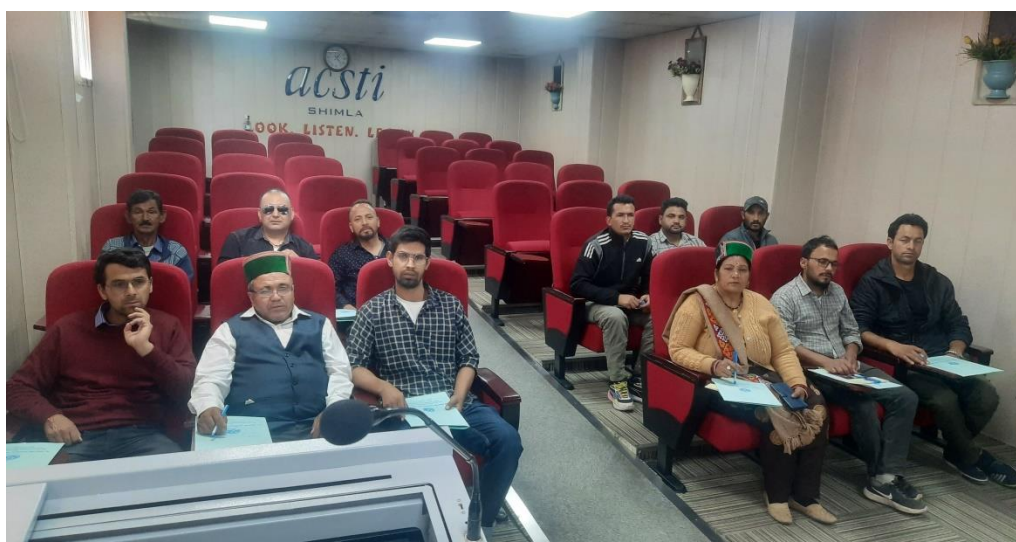
Figure 8. Participants of Capacity Building Training Programme organised for BODs and CEO of the FPO - Bari Fruit & Vegetable Grower cum Marketing Co-operative Society Ltd. at ACSTI, Shimla.

A capacity building training of BODs and CEO of the FPO – Bari Fruit & Vegetable Grower cum Marketing Co-operative Society Ltd. VPO Bari, Teh. Nichar, District Kinnaur was organized by HARP from 27 th to 29 th September 2023 at Agriculture Co-operative Staff Training Institute (ACSTI), Sangti, Summer Hill, Shimla, Himachal Pradesh. Total 6 participants (CEO & BODs) actively participated in this training programme.