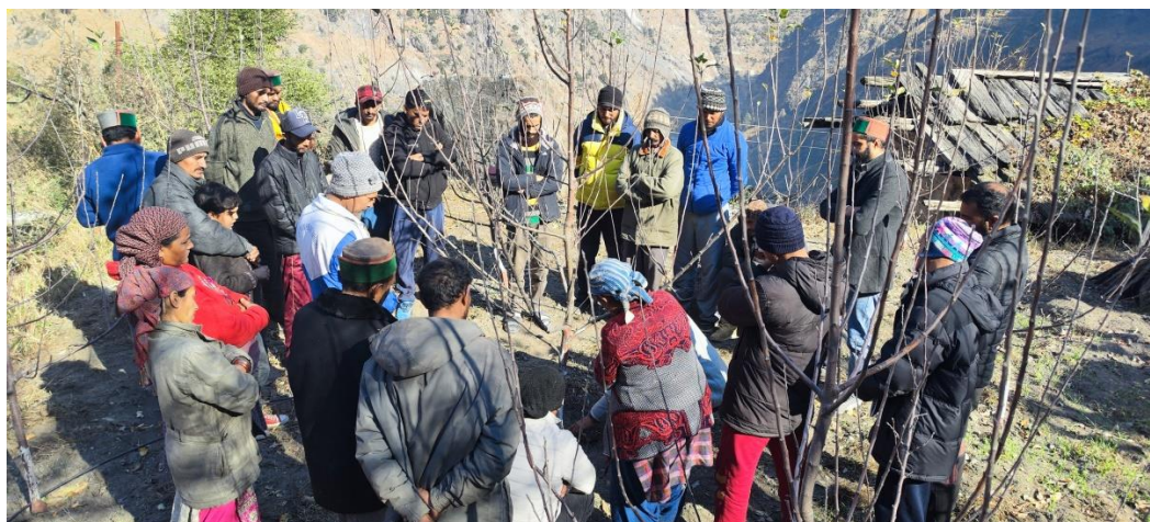
Figure 1. Skill development training in training and pruning of apple plants.