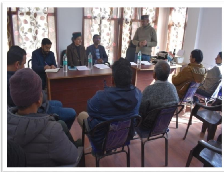
Project Monitoring and Implementation Committee (PMIC) meetings