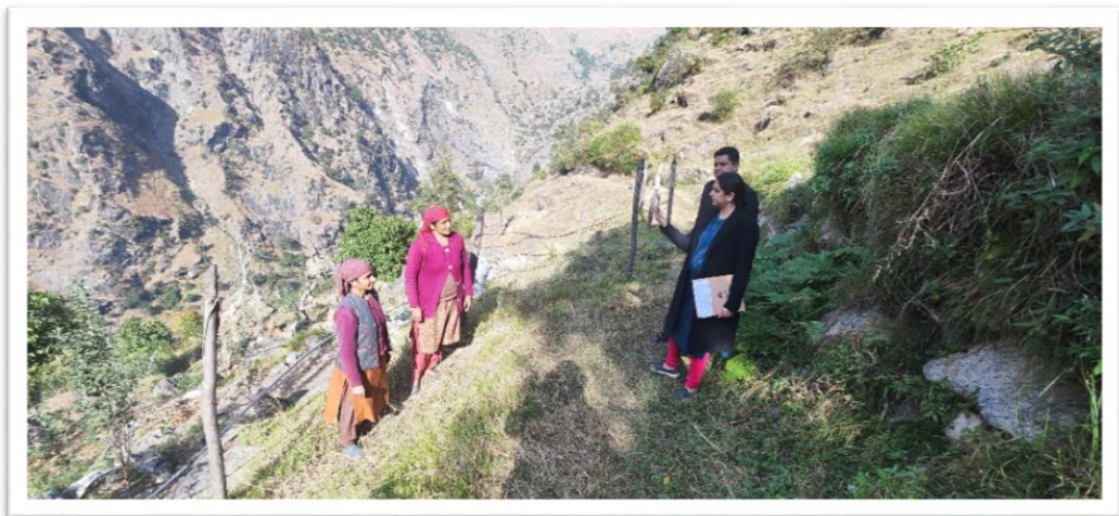
Internal monitoring of the project by NABARD Shimla, R.O. Officers