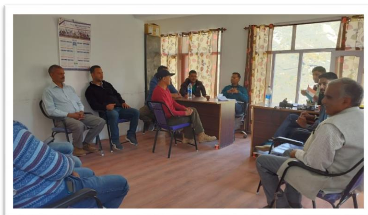
Project Monitoring and Implementation Committee (PMIC) meetings

For monitoring the project implementation, a project implementation and inspection committee has been constituted in which the members of village planning committee (VPC), members of project tribal development committee (PTDC), project implementation agency (PIA) are the members. The progress made under the project and other project implementation issues are being discussed and reviewed in the PMIC meetings. During the year 2024-2025 one PMIC meeting was held on 19 th January 2025 in which the officers from NABARD & SJVN, representatives of PIA and members of PTDC and VPCs were present.