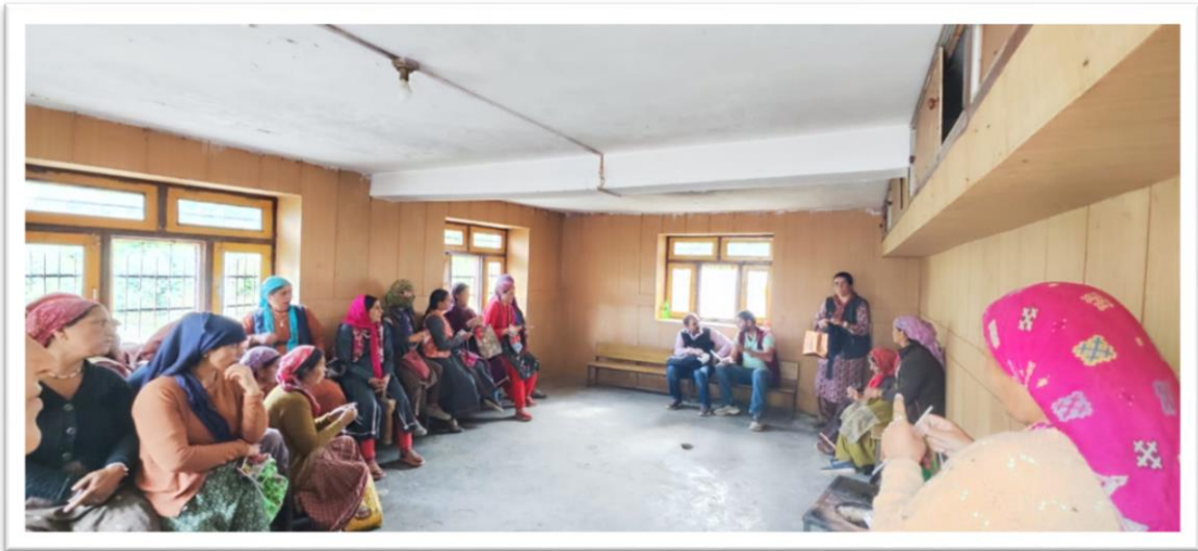
Awareness meeting held with stakeholders