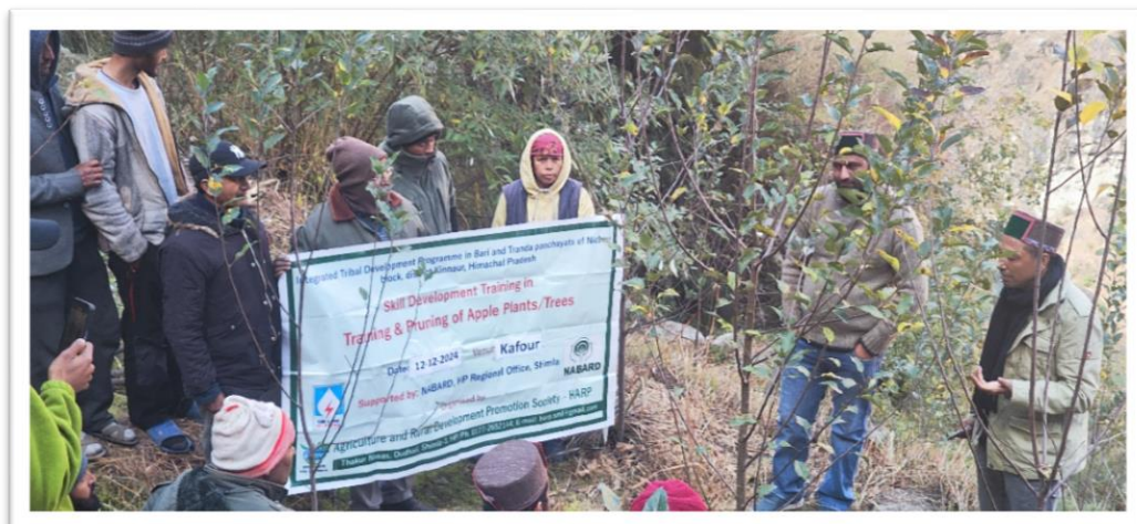
Skill development training in pruning of apple fruit plant