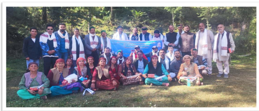
Exposure Visits of FPO (s) at Dev Bhumi cold store Bayal (Rampur) District Shimla and The Sapteshwar Mahraj Farmers Producers Organization (FPO), Teh. Theog, Shimla.