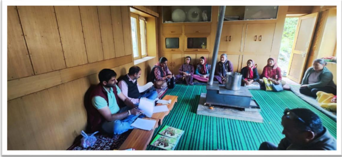
Awareness meeting held with stakeholders at Kirting