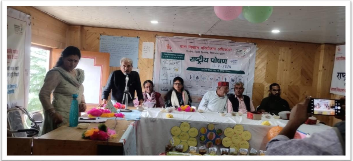
Rashtriya Rashtriya Poshan Abhiyaan