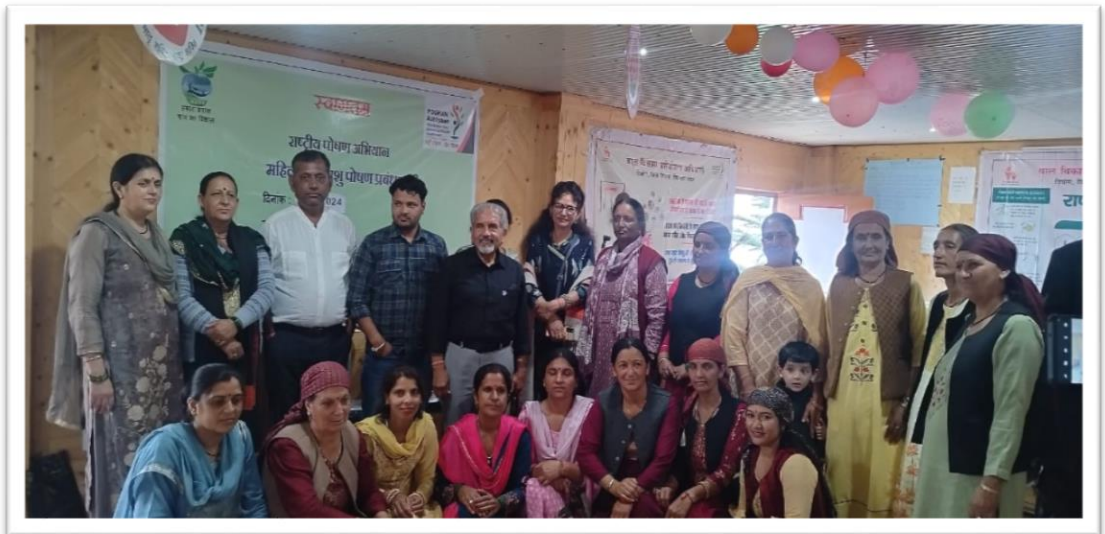
Rashtriya Poshan Abhiyaan