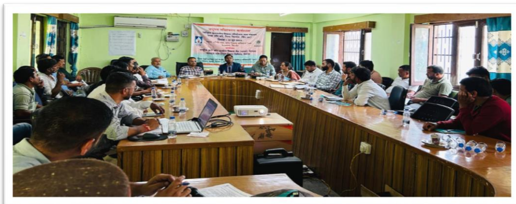
Experience Sharing Workshop