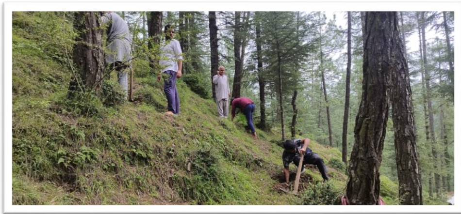
Forest tree plantation- “Ek Ped Maa Ke Naam”