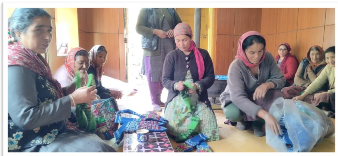
Awareness meeting held with stakeholders