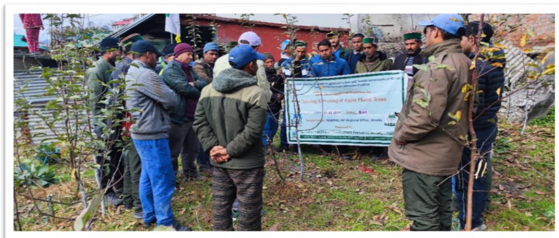
Skill development training in pruning of apple fruit plant