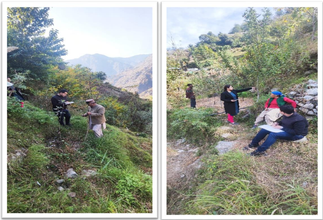
Internal monitoring of the project by NABARD Shimla, R.O. Officers

to the NABARD RO office and DDM Kinnaur.