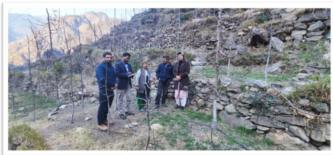
Visit of SJVN officers to the project area during January 2025