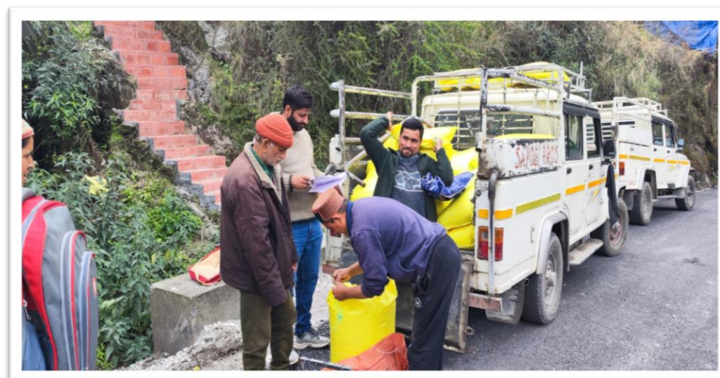
Distribution of inputs for off-season vegetable cultivation and training on growing vegetables