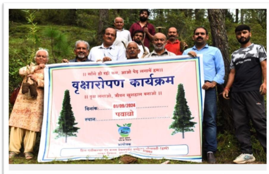
Forest tree plantation- “Ek Ped Maa Ke Naam”